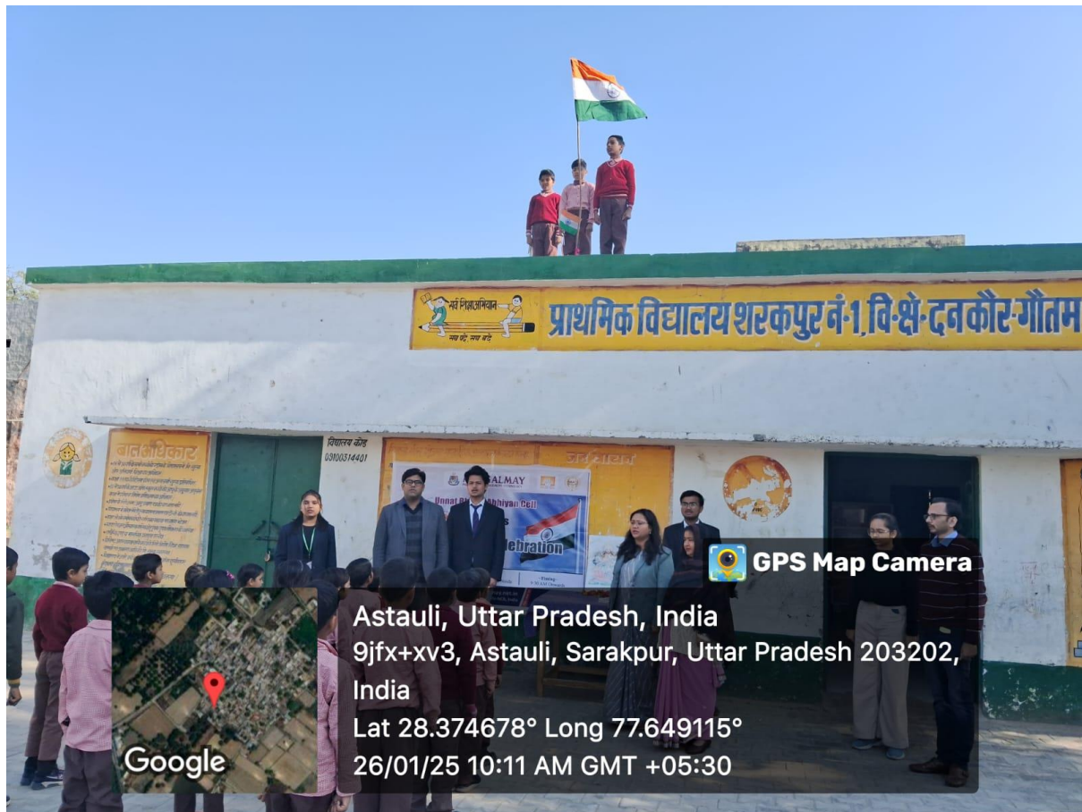
Figure 2 During the National Anthem after Flag hoisting ceremony