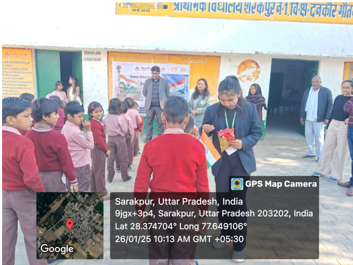
Figure 4 Distribution of candies after the flag hoisting ceremony.