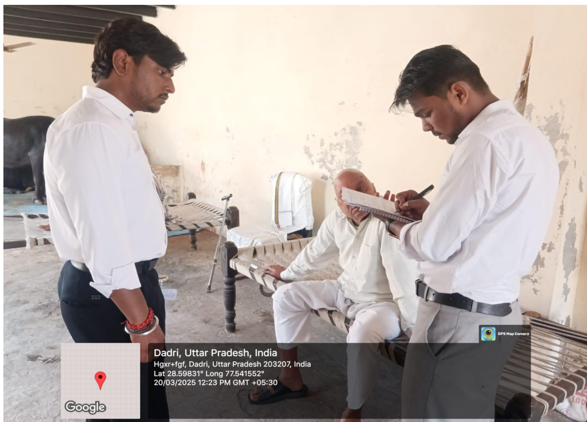
Figure 2 Students interacted with people of village Kudikhera