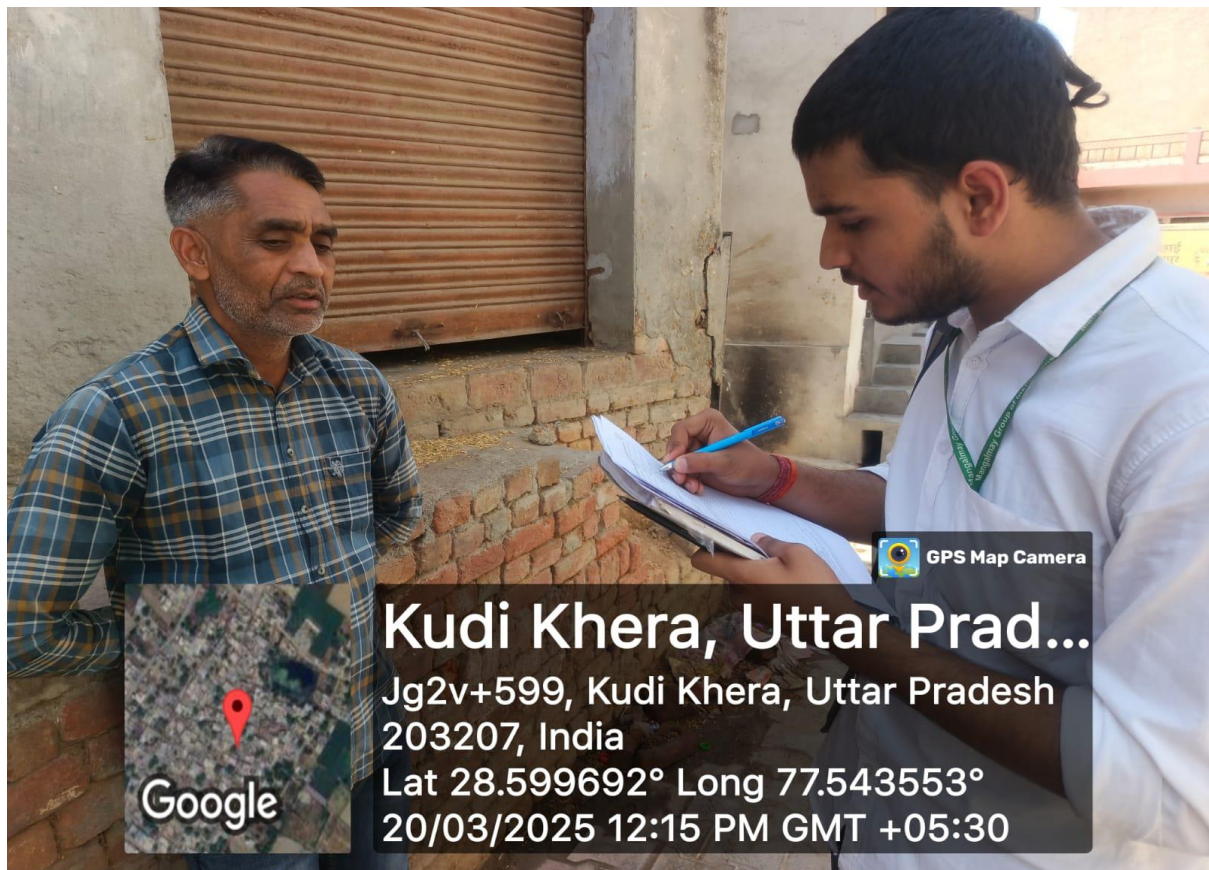
Figure 1 During the household survey student interacted with villagers and collect their basic information