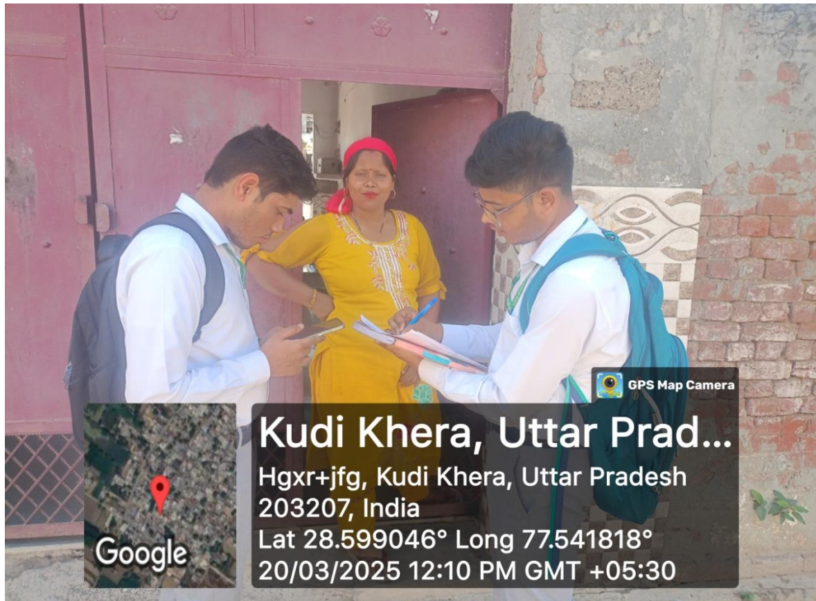
Figure 3 Student aware the villagers about the effects of plastic bags and collect their basic information.