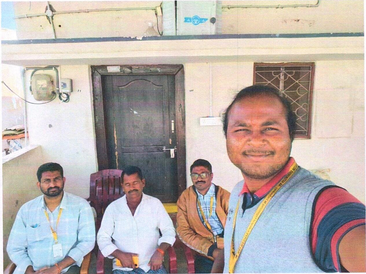
Fig. 1. Faculty and Recently Elected Village Sarpanch

agricultural development, reducing chemical dependency, improving crop productivity, and enhancing the overall socio-economic well-being of the farming community.