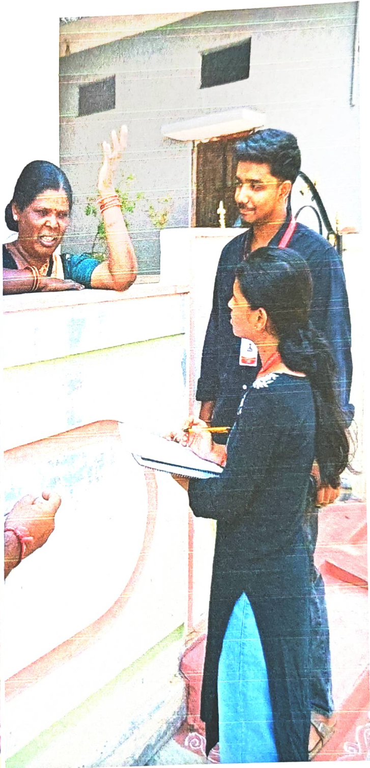
The students are interacting with village residents and taking survey