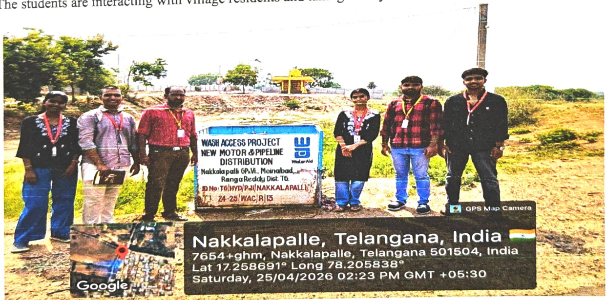
The students and Faculty visited Nakkala Palle Village for household survey