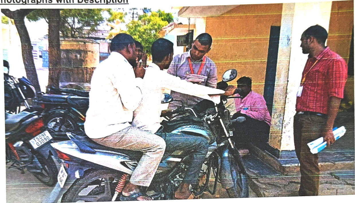
The students are interacting with village residents and taking survey