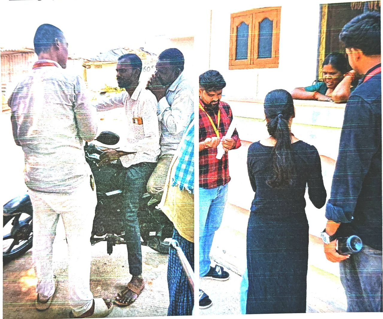
The students are interacting with village residents and taking survey