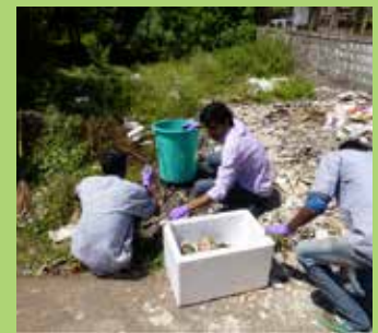
IISER volunteers involved in cleaning drive.