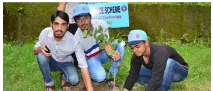
The faculty and students associated with NSS cell carried out tree plantation activity followed by the anti-polyethene drive in Distt. Hamirpur (HP).