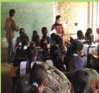
Our volunteers explained the importance of cleanliness & hygiene