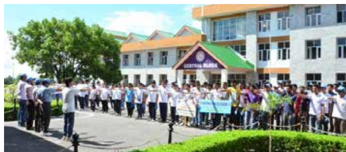
Pledge Ceremony for Celebration of Swachhta Pakhwada