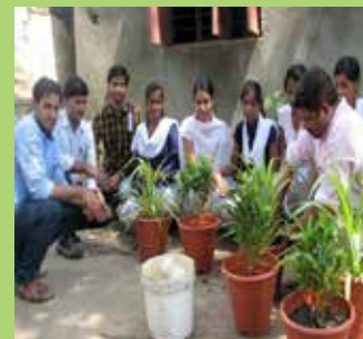
Potted plants for the village school.