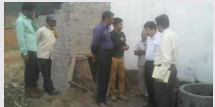
Study of existing sanitation practices with govt officials