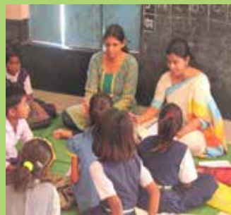
Children were educated about the importance of cleanliness.