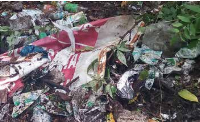
Shows the condition of premises before the cleanliness drive undertaken by students and faculty.

and undertook a drive to clean the surroundings of their departments. The NSS and NCC took up the cleaning of the common areas. The program was a real success and everybody felt satisfied and happy.