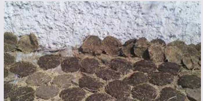
Identifying opportunities for waste management