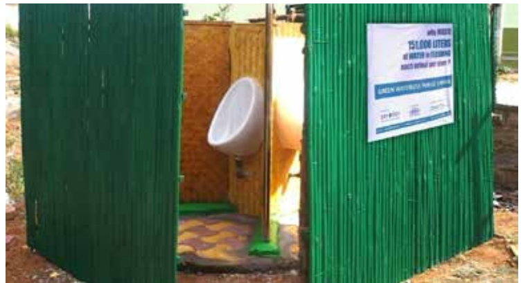
Toilet with waterless urinal technology Zerodor

minimize the amount of water consumed in flushing to mitigate excessive demands on water supplies as well as on waste water disposal systems.