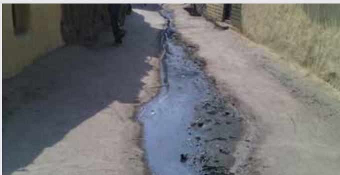
Study of existing systems of wastewater disposal.