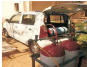
Filling Bio-CNG in car