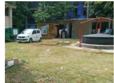
BDTC in IIT, Delhi