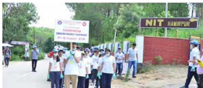
Awareness Rally was also organized by NIT students from NIT Gate No. 1 to Anu Bazar followed by the mass cleanliness drive to create awareness about cleanliness among masses.