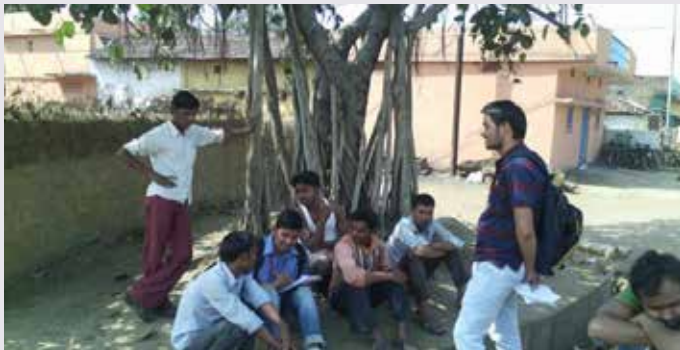
Survey to understand issues

programs and budget provisions for them so that suitable action can be taken. A training program on best sanitation practices, and best construction practices is proposed to be organized.