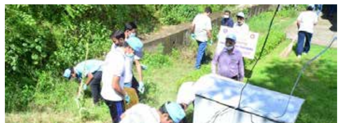
NIT students carried out mass cleanliness drive in the NIT Campus from NIT Administration Block to Area Silver Jubilee Gate No. 1