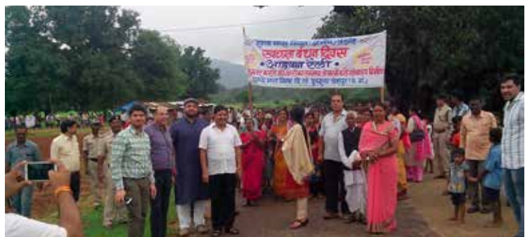
Swachh Bharat rally in village Lohardaga (Cluster adopted by IIT Delhi under Unnat Bharat Abhiyan)