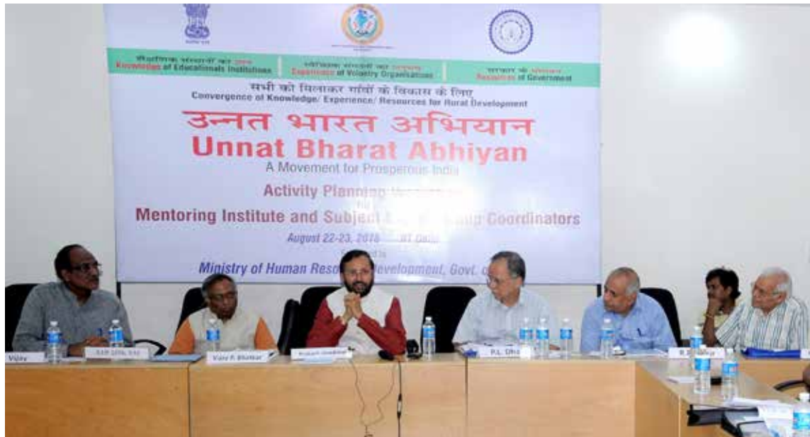
Hon'ble Minister for Human Resource Development, Govt of India, Shri Prakash Javadekar addressing a key workshop of Unnat Bharat Abhiyan with its leading lights