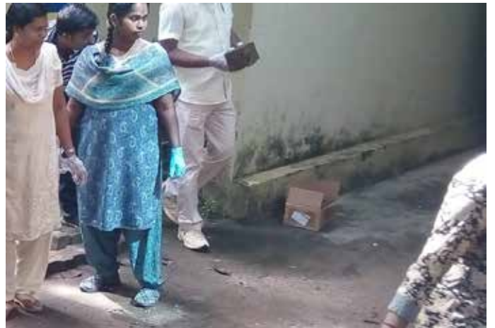
Depicts the premises after cleaning during the cleanliness drive .

The water carriage system or the Flush system without water is always a problem in itself, many researchers have come up with the concepts of dry latrines. Some of the dry latrines are - the Zero discharge toilet developed by Prof. V. Tare (2010) of IIT Kanpur and the dry latrine developed by the Prof. K. Munshi of IIT Mumbai (Munshi, 2013).