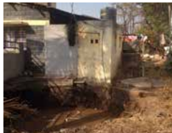
A view of toilet linked biogas plant in a village in Kolhapur district, Maharashtra