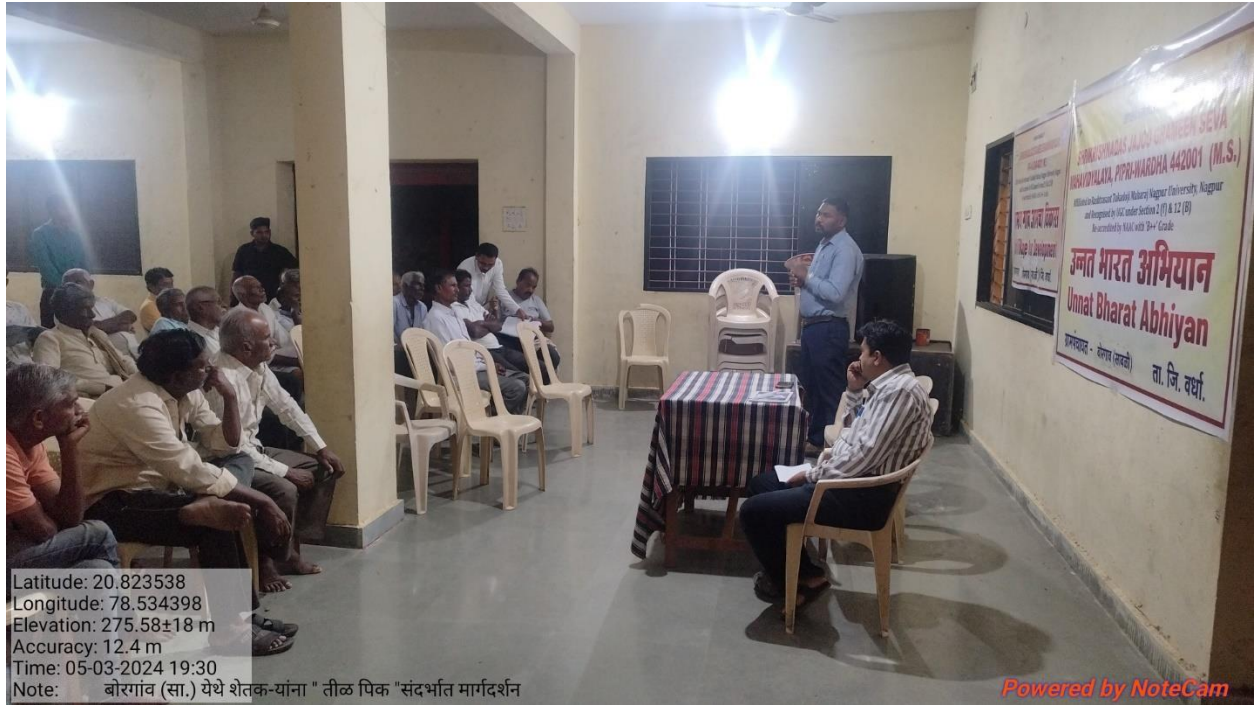
Farmers attending guidance programme on Cultivation of Sesamum Crop at Borgaon Sawali