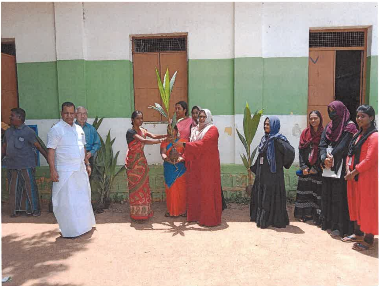
Distribution of Coconut Sapling to build rapport between Village People & Members UBA AIMAN TEAM with village counsellor – Mattaparapatti

PRINCIPAL AIMAN COLLEGE OF ARTS & SCIENCE FOR WOMEN TRUCHIRAPPALLI-620 021.