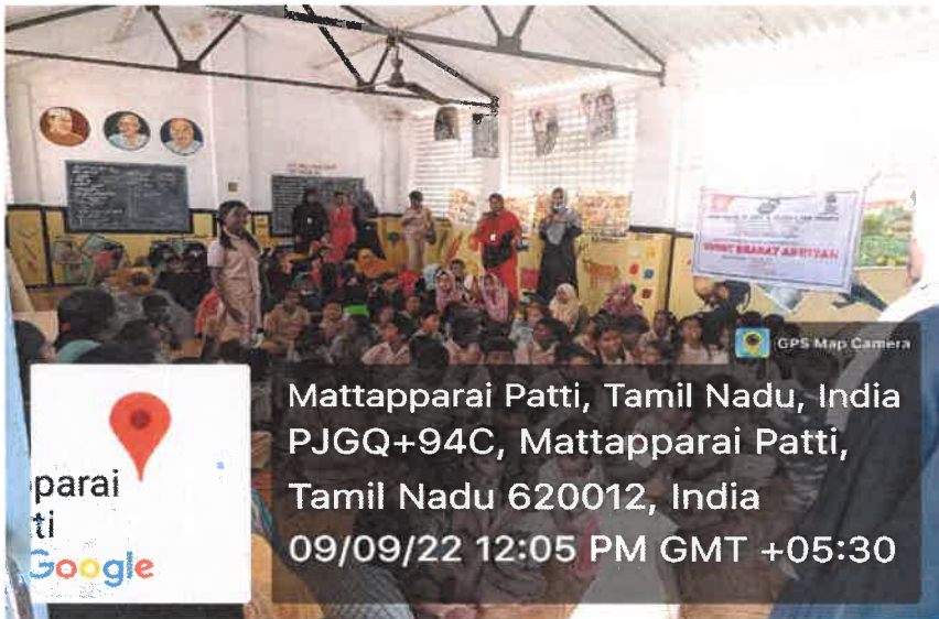
Students while explaining “How to use computers