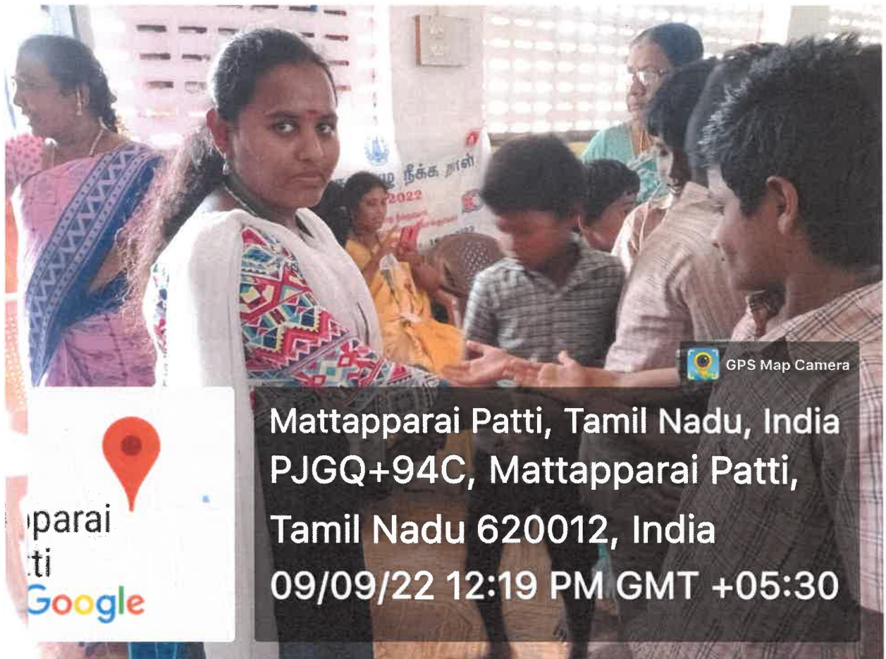
Distributing gifts to the mattapparapatti village school students

PRINCIPAL AIMAN COLLEGE OF ARTS & SCIENCE FOR WOMEN TIRUCHIRAPPALLI-620 021.