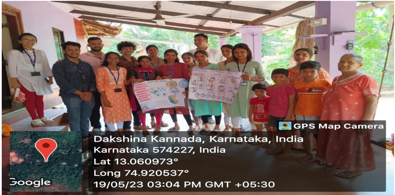
Team involved in spreading the Awareness on “Environment Protection”