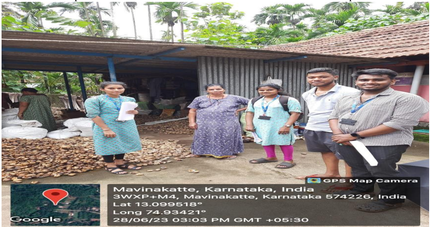
MITE-MBA students team with a responded in Paladka

For various reasons the farmers of South Canara district are switching from paddy to commercial crops cultivations. This in turn has reduced the supply of brown rice in the district. Due to this in the recent years; the price of this core edible commodity has increased. The recent reduction in the quantity of brown rice in South Canara has decreased the quality of this rice. Hence, it is necessary to understand the reasons for such change from food based crop to commercial crop and to give some strategies retain the farmers in rice cultivation. In this regard, a team of 6 MITE-MBA students conducted a survey to understand the reasons to switch from paddy to commercial crop. The study revealed that the increasing labour rate, unavailability of labour, unavailability of much matured technology, problem of wild animals and the changing environment and weather conditions are the key reason for switching to commercial crops. Development of suitable technology and reducing the technology dependency on other states and working towards sustainable development are the need of the hour to retain South Canara farmers in rice production.