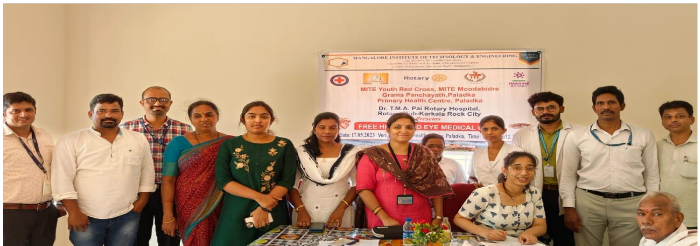
Panchayath officials visited the eye check up venue