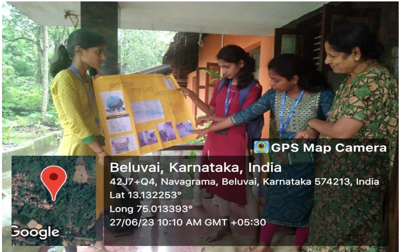
MITE-MBA students presenting about the low budget rain water harvesting system

On the 26 th of June 2023, a team from MITE-1 st year MBA 1 st conducted an awareness campaign about the rainwater harvesting. This program was conducted in Beluvai village specifically in Gandhinagar, Kesargadde and Navagrama. This awareness campaign successfully educated 100 households about the importance and benefits of sustainable water management practice. Through informative sessions, practical demonstrations, the residents were empowered to implement rainwater harvesting systems and actively contribute to water conservation. Campaign outcomes included increased awareness, adoption of rainwater harvesting systems and water conservation. The programme helps ensuring long term planning of rainwater harvesting to targeted households and inspire others to embrace this environmentally friendly practices.