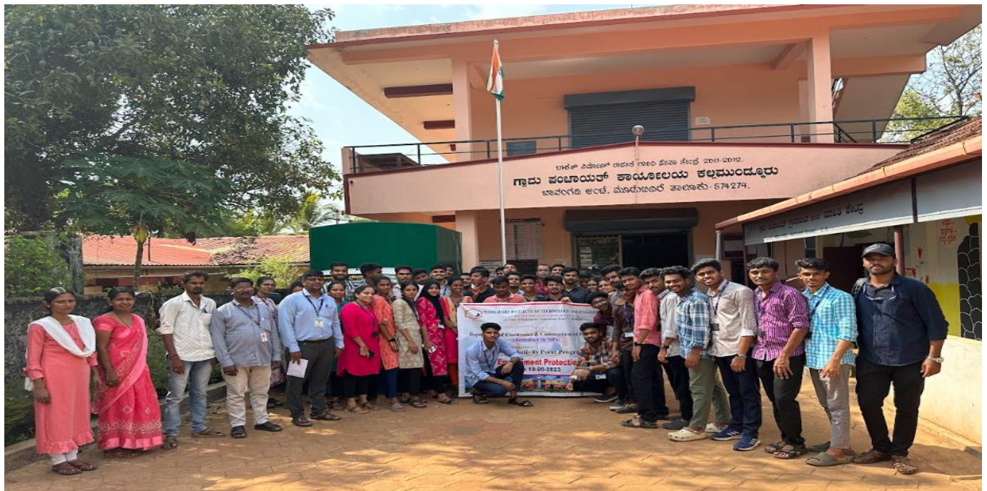
Group of students involved in Environment Protection Awareness Programme