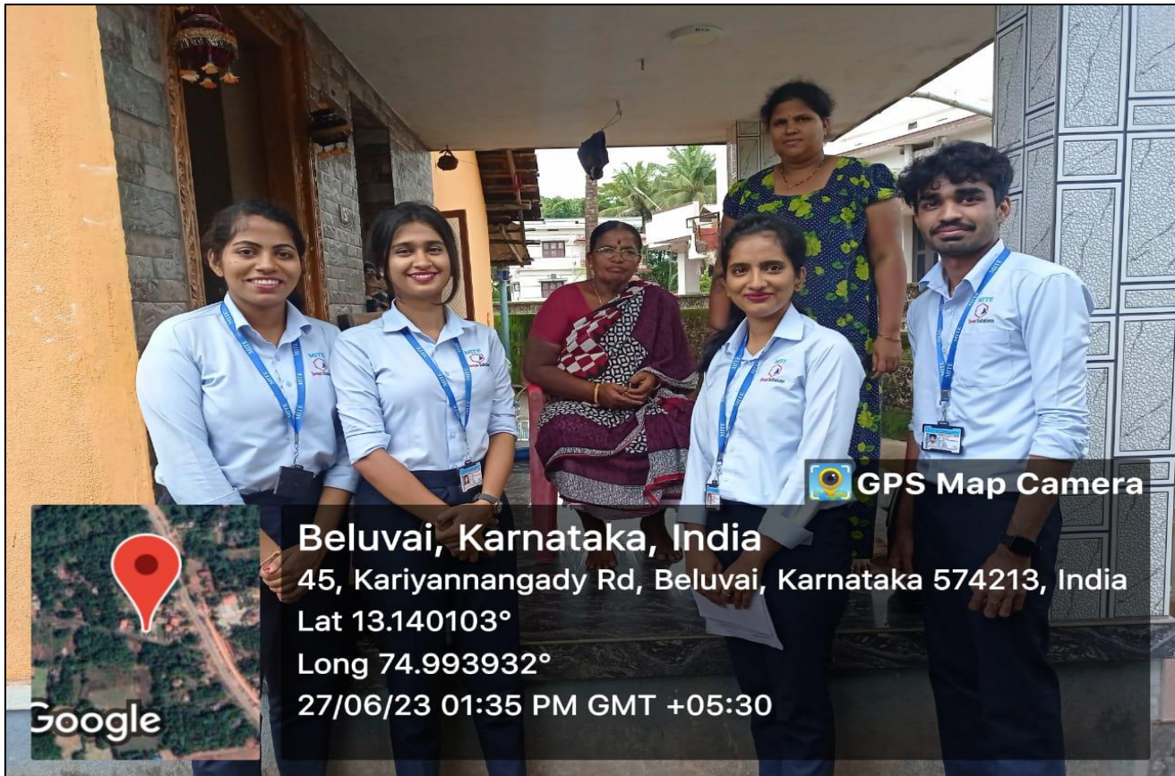
Students team in a house at Beluvai

As a part of MBA program, under the societal project course, 5 students gave awareness on Government Schemes to the citizens of Kanthavara and Beluvai village. The features, eligibility criteria and the benefits of Gruha Jyothi scheme of the state government, Mahila Samman Bachat Patra scheme, Pradhan Mantri Jeevan Jyoti Bima Yojana, Karnataka Bahgyashree Schemes were discussed in details to the citizens of selected two villages. Through mobile phone, students demonstrated the procedures of filing applications for the above stated schemes. A total of 100 houses were covered for the program. The hose holds, members of the village Panchayath and the village Panchayath officers appreciated the work of MBA students.