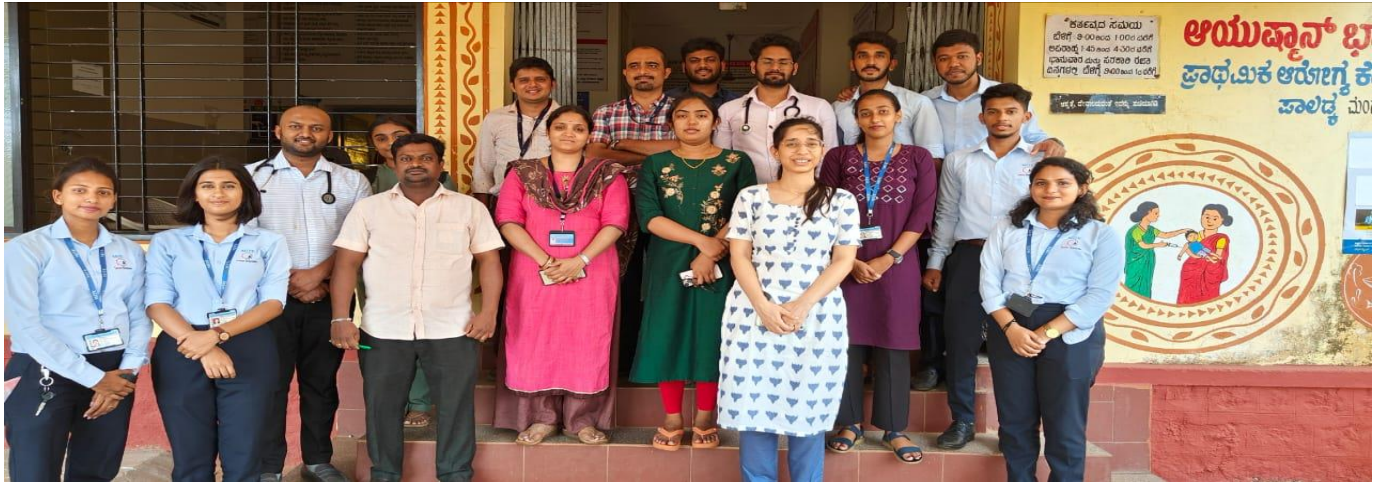
Group photo with KMC medical team