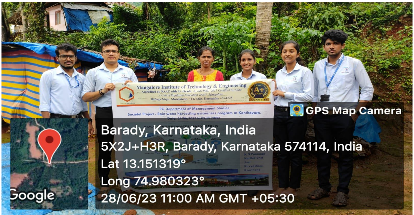
Rain water harvesting awareness program team at Baradi

Due to the increased global water crisis and need for sustainable water management practice, a team of 5 students from the department of Management Studies decided to give awareness on the rain water harvesting to the people of Kanthavara and Beluvai. Under the social project program, this team of five members visited 165 houses on 27 th and 28 th of June, 2023. With the help of a printed banner and pamphlets provided by the Grama Panchayath, students demonstrated the simple low cost rain water harvesting kit to the households of Kanthavara and Beluvai villages. During the program, the beneficiaries raised questions on the costing and vendors details for installing rain water harvesting kits in their respective houses. During the visits, students discussed about the global warming, ground water level estimates and the futures situations for quality water in the globe. This program was appreciated by the officials of the Panchayath.