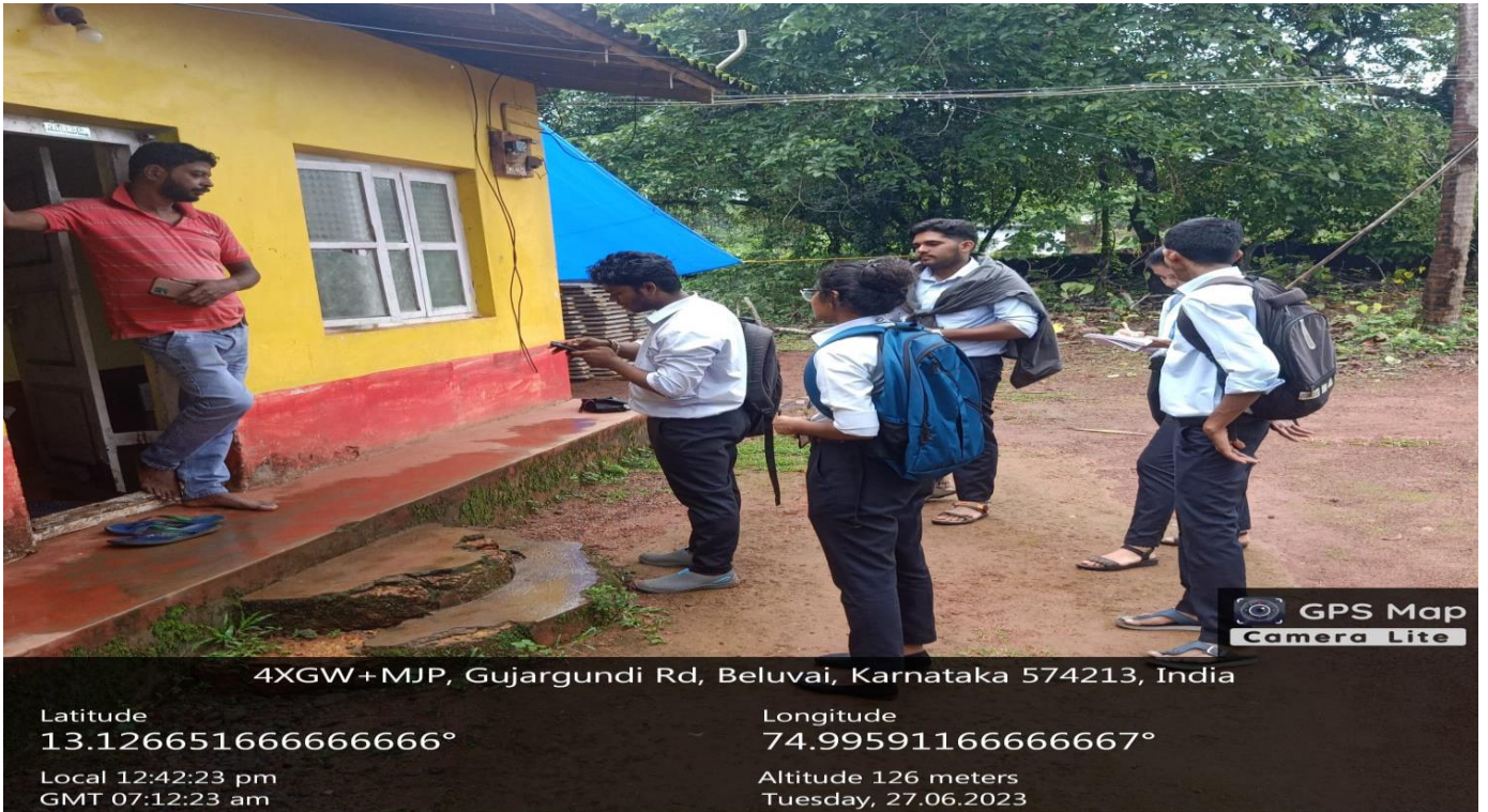
MBA students taking entry of responses at Beluvai

A survey on e-banking and fraudulent activities was carried out in Beluvai village. During the survey, awareness on fraudulent activities was also given to the villagers of Beluvai. The data about e-banking and fraudulent activities was collected through the questionnaires. The team of 6 students was divided into 3 groups to reach maximum number of people in short time. Respondents stated that the convenience, easy management, low transaction cost and multiple payment platforms are the major benefits they enjoy from mobile banking service. However, for a question about frauds and scam calls, a very few of them stated that as an issue and majority of the respondents have not experienced that fraud and scam calls yet. The survey results revealed that the education and the age are the major determinants of mobile payment and e banking usages.