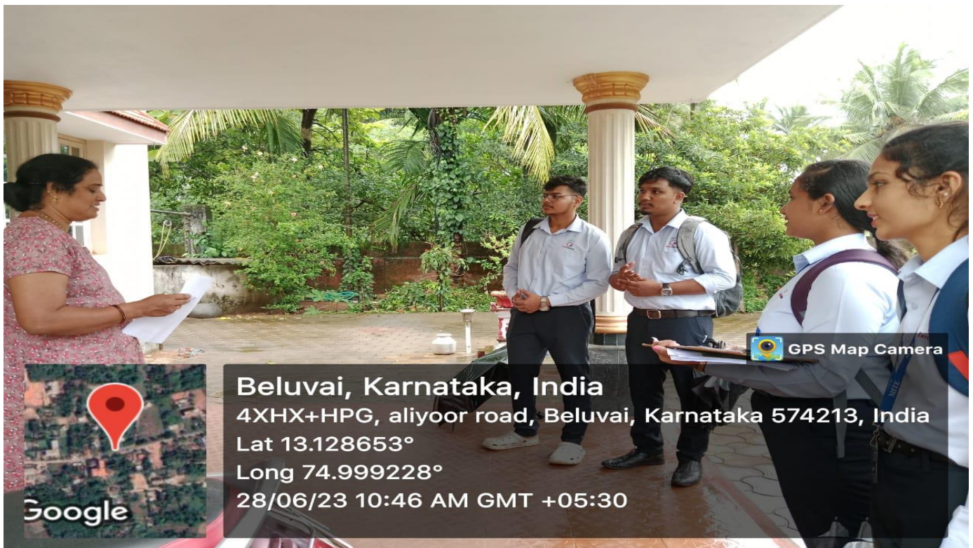
A villager reading the pamphlet and team members are explaining content in local language

On 27/06/2023, a team of 5 members from Mangalore Institute of Technology & Engineering visited 'Kanthavara' village as a part of Societal Project assigned by the University opting 'Awareness on Green Crackers' as the project topic. Bursting firecrackers lead to a lot of air pollution. There are dense clouds of smoke after the day of several festivals. Burning crackers releases toxic air pollutants like carbon dioxide, nitrogen oxide, sulphur oxide, trioxide, black carbon and other gases leading to production of dense clouds of smoke. This affects eyes, throat, lungs, heart and skin. Hence, as an alternative, students have made an attempt to spread awareness among rural people about green crackers. Brochures consisting of how green crackers are better than regular crackers and the benefits of green crackers were used to convey the message. 100 houses were covered within two days.