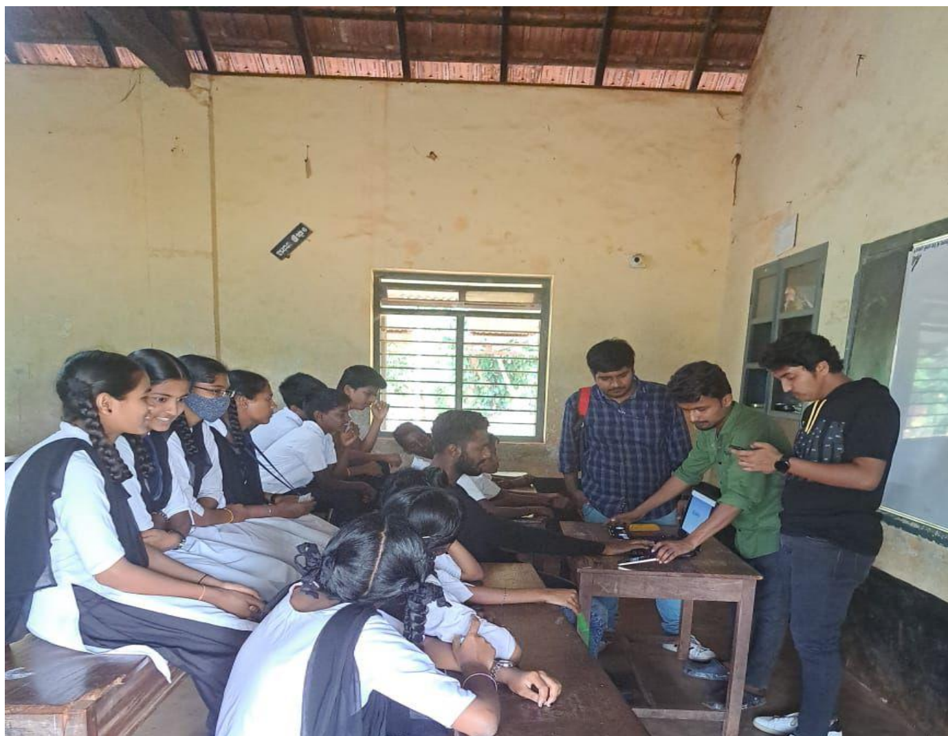
Aero MITE Students interacting with school students

Afternoon session was held to make understand the importance of education and various points to keep in mind while choosing the carrier. Our students guided them in various aspects including scholarships, courses after 10 th and many more. At last, we donated fans and provided them with the momento as a token of gratitude.