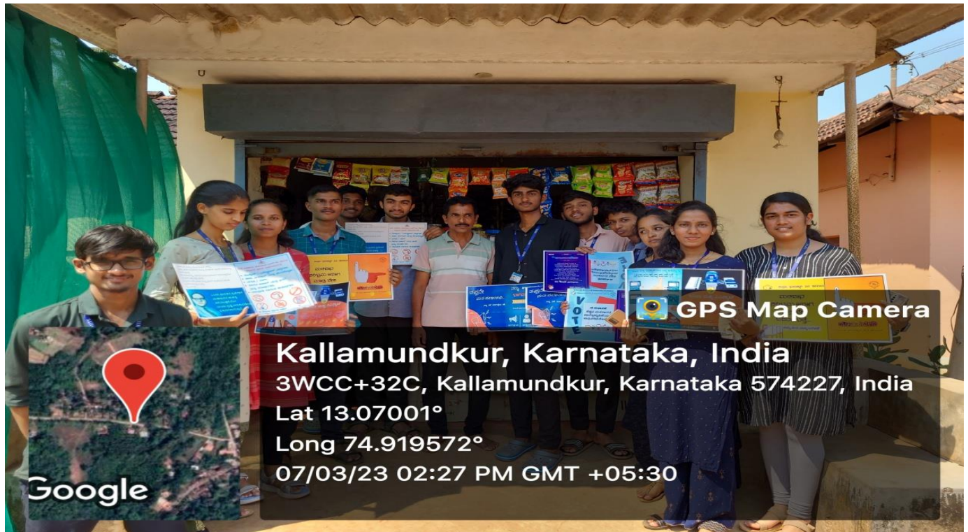
Team involved in spreading the Election Awareness