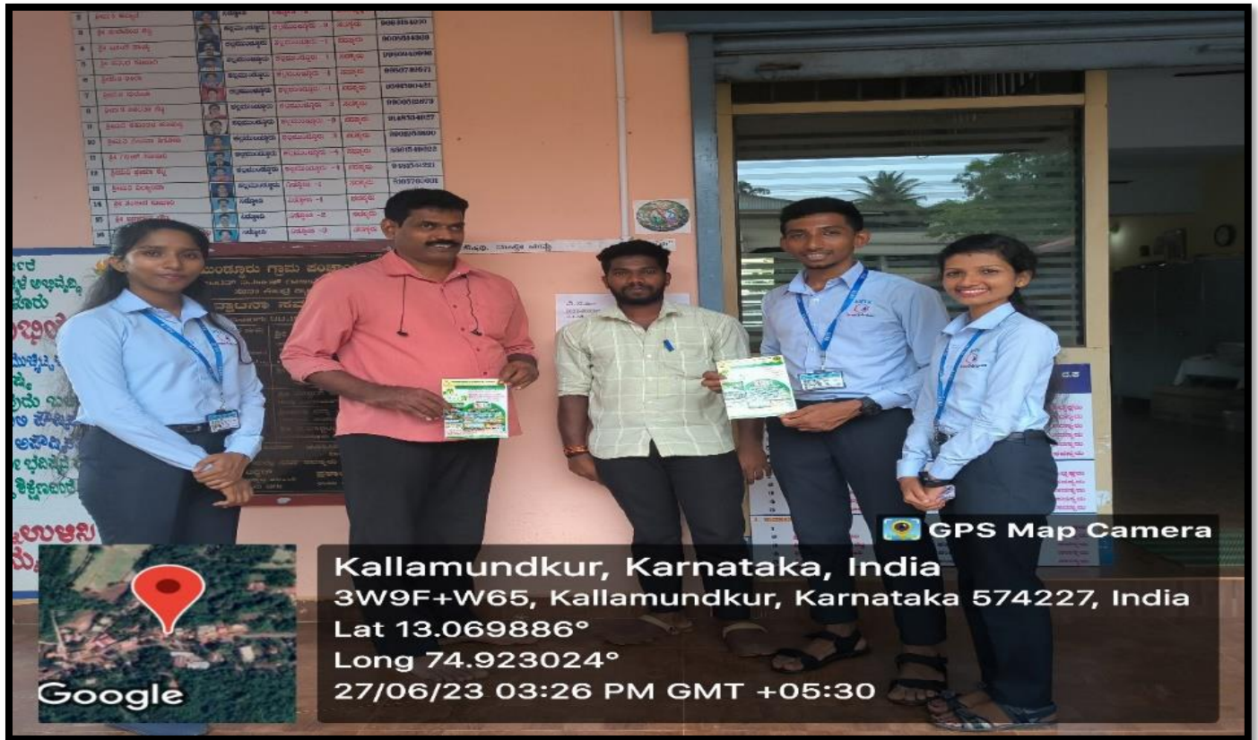
MITE MBA students team with Kallamundkur PDO

Plastic, which is a hazardous material, is manufactured very easily, however when it came to time of disposal or destroying this, it causes pollution to environment. Day in and day out we human beings use plastic. No matter if you are rich or poor, plastic has become part and parcel of life or in other words, knowingly or unknowingly we have made plastic indispensable. This program has made an attempt to sensitise the student community and society this issue through a plastic awareness campaign. This campaign was organized on 27 th and 28 th June 2023 at Kallamundkur village. A group of 6 students have visited to more than 100 houses at Kallamundkur and they have created awareness through pamphlets. This program of the institute was appreciated by the officials of Kallamundkur Grama Panchayath.