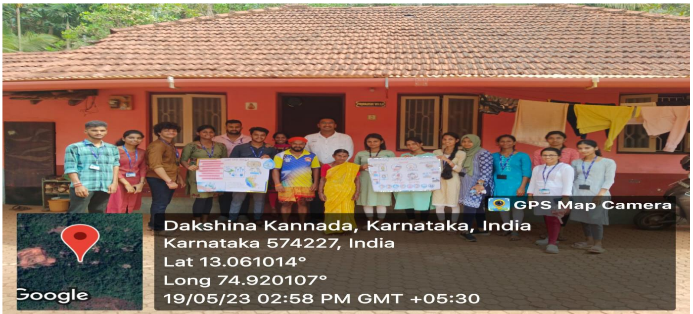
Team involved in spreading the Awareness on “Environment Protection”

In this regard the 3 rd year Electronics & Communication Engineering students along with faculty members made an effort to spread the awareness in Kallamundkur village. Total of 87 students were actively participated in this social awareness programme. Students provided the information regarding environment protection and also related to rain water harvesting & water borne diseases through posters and charts. The aim of protecting the environment is to make it a healthy place for the present and future generations to live in. People are exploiting the natural resources in the name of development without thinking of its adverse consequences on the earth and its living beings.