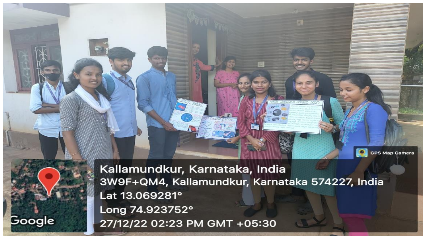
A batch of students spreading the digital awareness about online payments

Final year students and faculty members of Electronics and Communication Engineering department organised a digital awareness program in Kallamundkur village. A total of 98 students and 2 faculty were actively participated in this awareness campaign. Students visited the houses and conveyed the awareness to the village people about digital India. The initiative of Digital India has brought a great success for the Indian citizens. This was evident in the pandemic period where all the corporate, schools were closed down. With the help of digitization, the employee can work from their home there was no requirement to go to their offices for works. The purpose of this program was to create awareness among the students and villagers regarding the usages of various digital platforms.