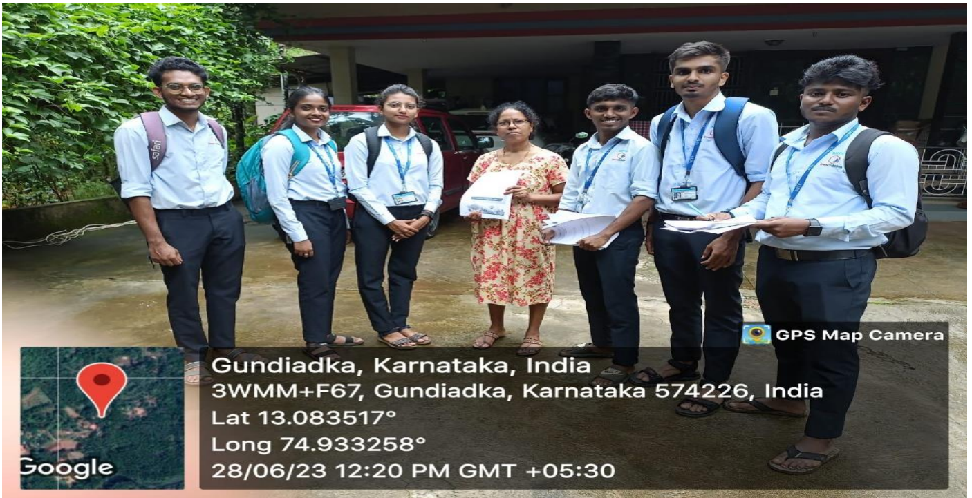
MITE MBA students in a house at Paladka

Increased use of chemicals, fertilizers and pesticides in the agriculture has caused environmental degradation such as soil erosion and water pollution which is harmful for the human body. Hence, promoting organic farming is the need of the hour. In this regard, on 27 th and 28 th of June 2023, a team of 6 MBA students visited to Paladka village to carry out an awareness program on organic farming. This program was part of MBA education under the course titled societal project. The aim of this program was to educate the rural households of Paladka on the adverse effects from the use of chemicals and fertilizers on the human health. In the program students educated on the attractive pricing of organic products in the market. The program was carried out with the help of pamphlets covering the advantages of organic farming and the adverse effects of chemicals and fertilizers. A total of 112 houses were covered in this 2 days program and the program was appreciated by the officials of Paladka Panchayath.