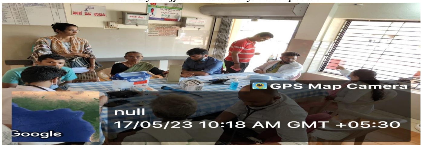
Free checkup from the General Medicine department of KMC