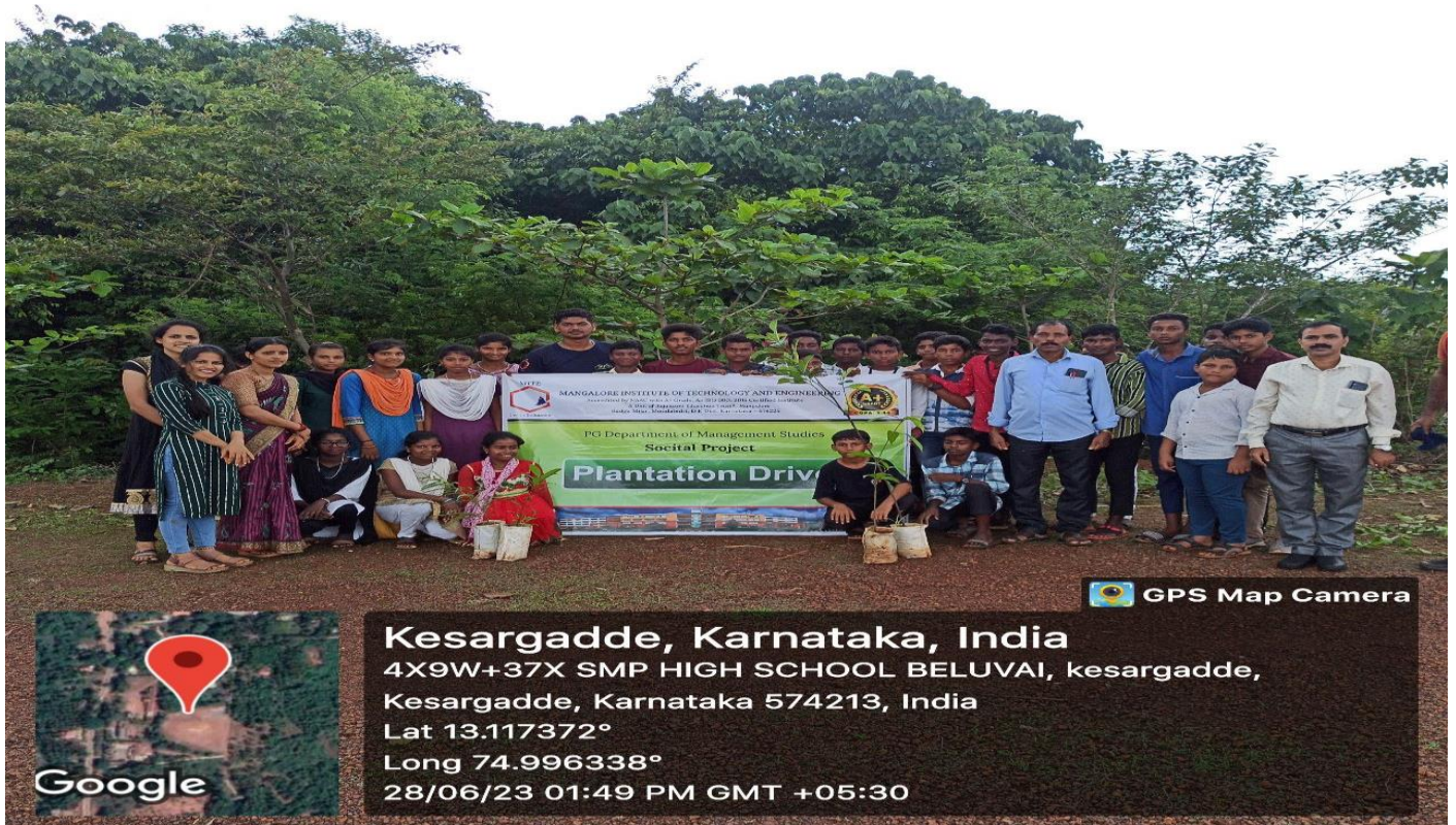
MITE MBA students team with Kesargadde school kids and teachers

As part of MBA program, a team of 6 students of carried out a social project in 3 UBA adopted villages. Those villages are Paladka, Beluvai and Kanthavara and the program plantation drive. The purpose of this program was to inculcate the plantation habits among school kids. A total of 51 saplings were planted in 7 government schools. During these programs, MITE MBA student's team spoke to the students of all 7 schools and they explained the need of planting trees and the present status of environment pollution. This program was appreciated by the school teachers and management. The students of those 7 schools understood their responsibility to plant trees and save this earth. Further, the school kids enjoyed the day with some extracurricular activities of our students.