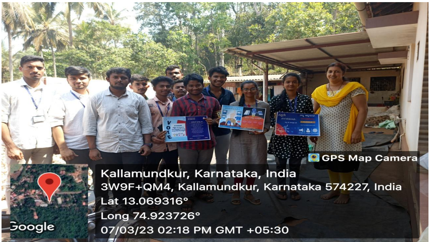
Team involved in spreading the Election Awareness

Vote is the fundamental right of every eligible individuals of the country. However, due to various reasons, many may not come forward to vote. In the past we have heard about 65% or 50% voting in some locations. Few may not go for voting because of the hectic process involved and some time they are not comfortable with the ballot voting machine. In this regard, our team has made an effort to demonstrate the voting procedure and motivated them to take part in the voting process.