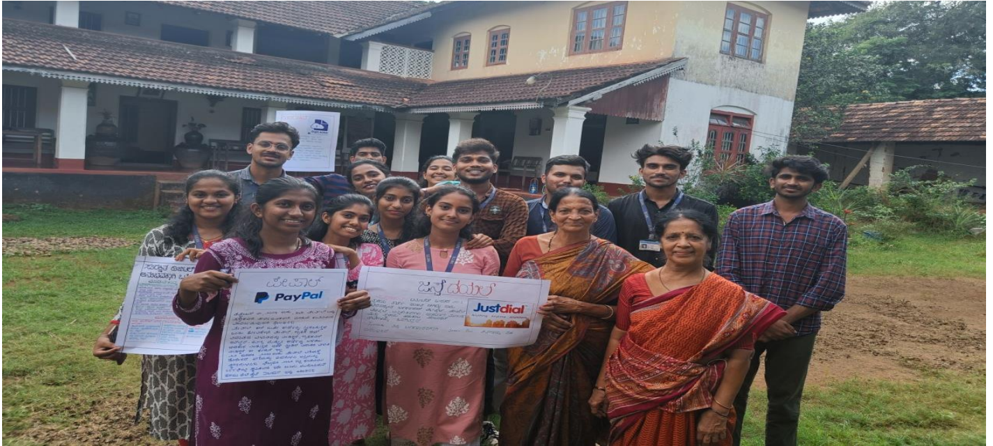
A batch of students spreading the digital awareness about online payments

Students visited the various houses in Kallamundkur village and gave information on digital India initiatives of the government. The functioning of various online payment platforms, online government service portals and Seva Sindhu portal were demonstrated to the students and people of Kallamundkur village.