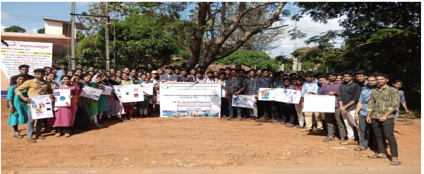
Group of students involved in spreading the digital awareness programme in Kallamundkur Village