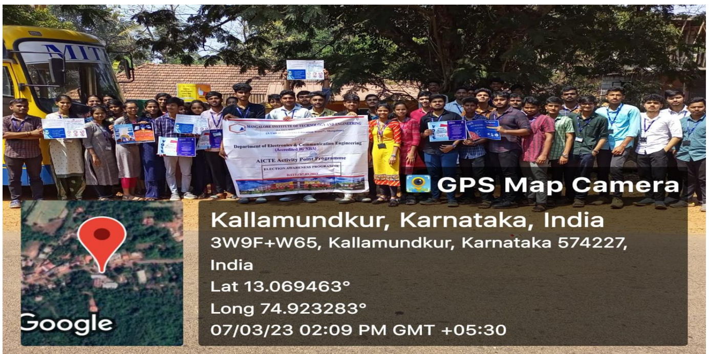
Group of students involved in Election Awareness Programme