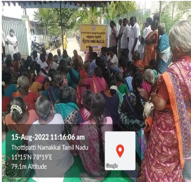
15-Aug-2022 11:16:06 am Thottipatti Namakkal Tamil Nadu 11°15'N 78°19'E 79.1m Altitude