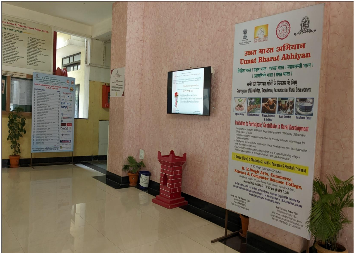
Unnat Bharat Abhiyan Banner in College Campus