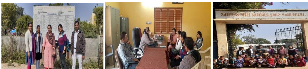
Village survey at Titoda; Meeting with Talati and interaction with school principle and students at Adraj moti village

Group of faculty members and students visited selected villages and interacted with Village Sarpanch, Talati, School principals, students and other people to understand village ecosystem and different issues to find out scientific solution. Also discussed the developmental activities to be introduces in the village to facilitate with the help of University students and faculties.