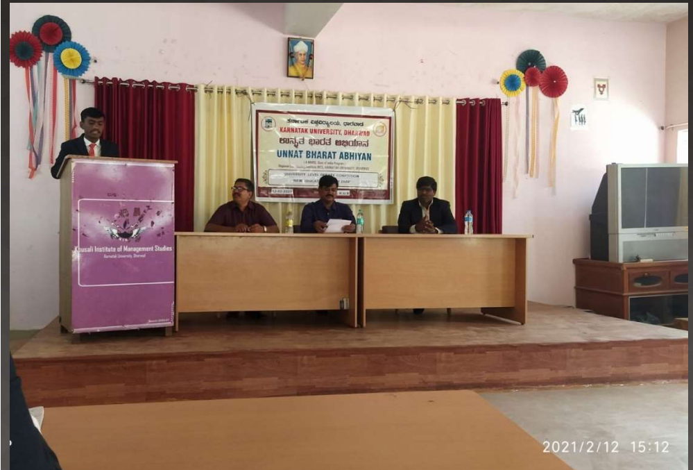
A Glimpse of presenting the program and welcoming the Guests.