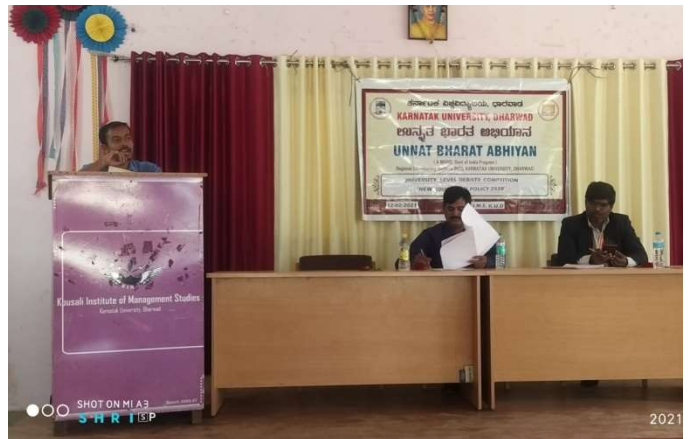
A glance of selected Best Candidates presenting their Debates