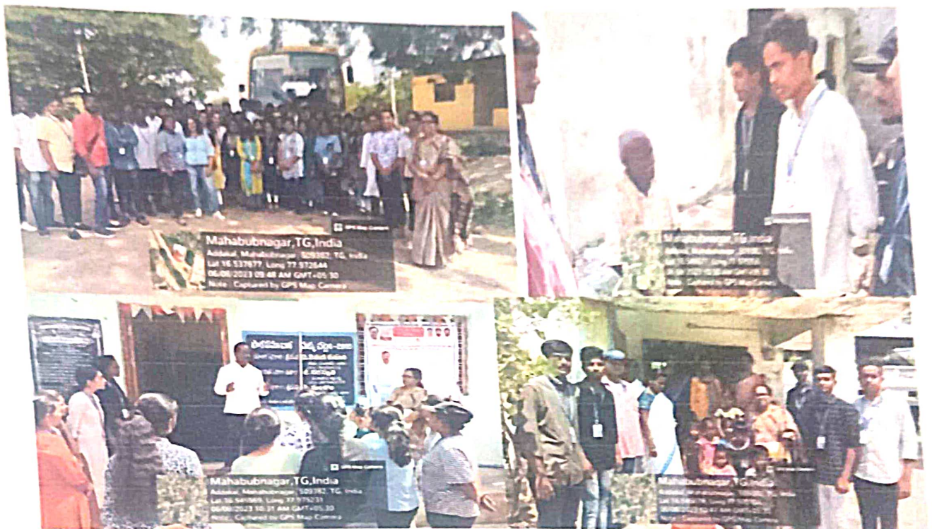
Fig: Students and Faculty interacting with End users