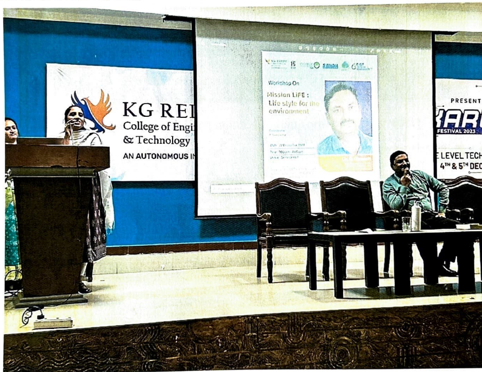
Fig: Introducing the Chief Guest