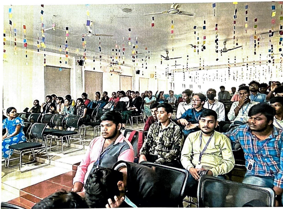
Fig: Participants in the seminar hall