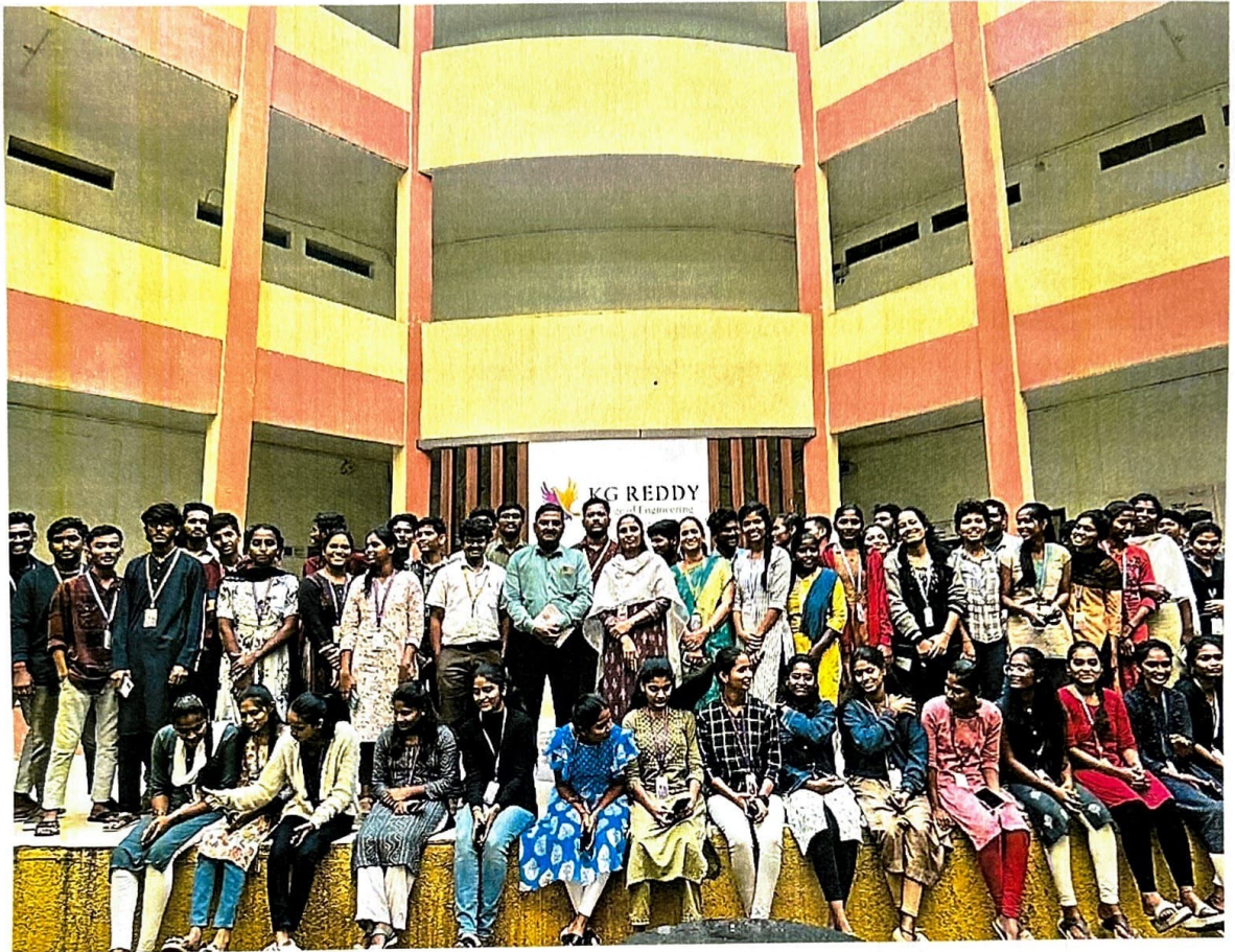
Fig: Group Photo of Chief Guest with the participants