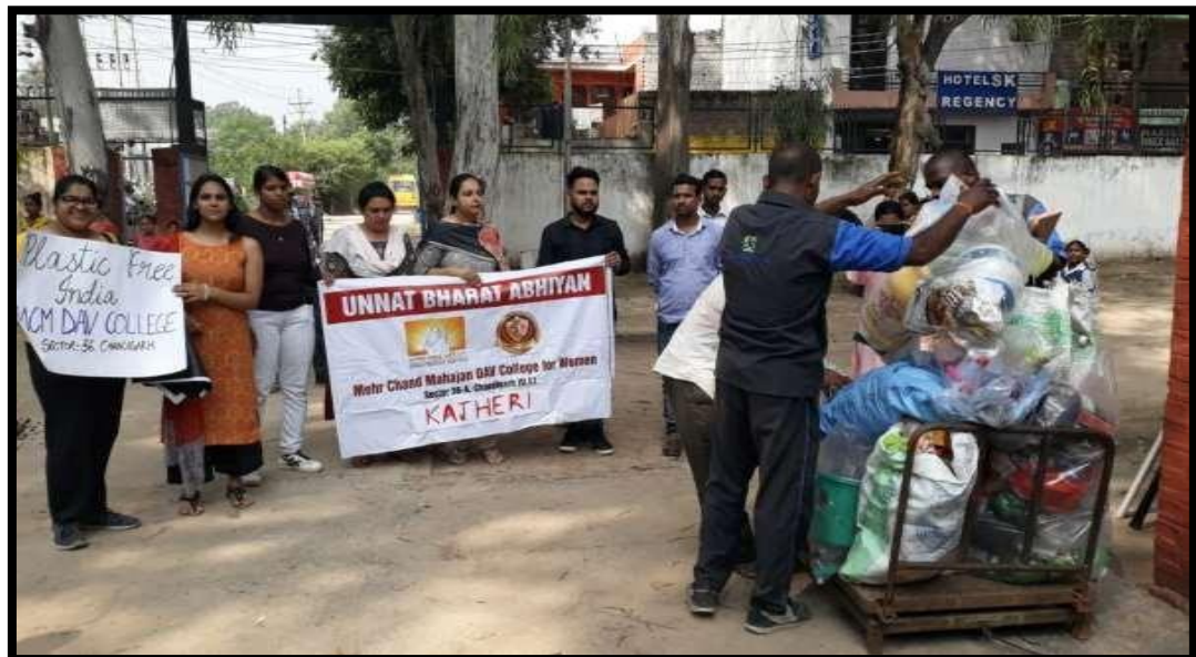
Collection of Recyclable Plastic and Selling to Junk Dealer