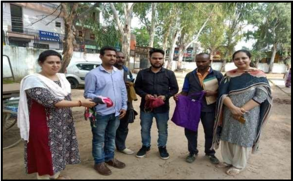
Distribution of Cloth Bags to Municipal Corporation Officials