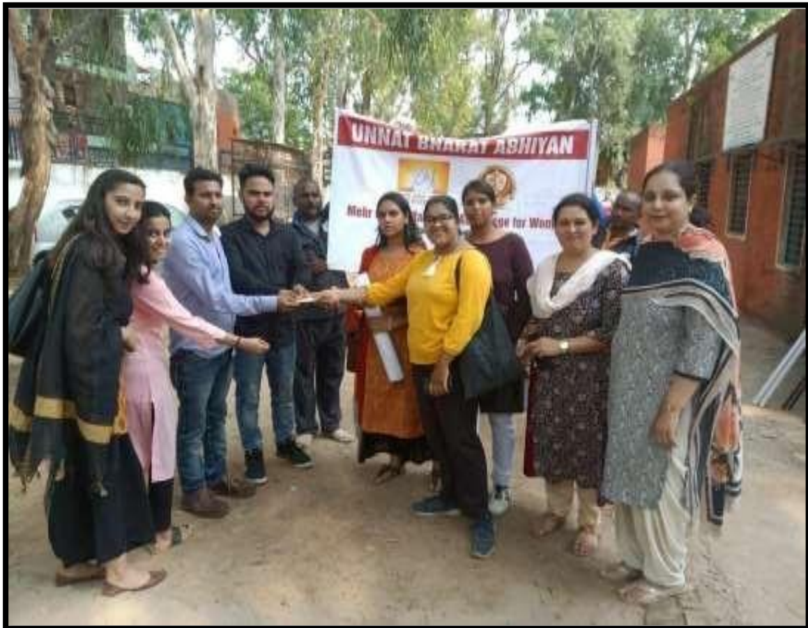
Collected Cash Handed over to Municipal Corporation Officials after Selling Plastic