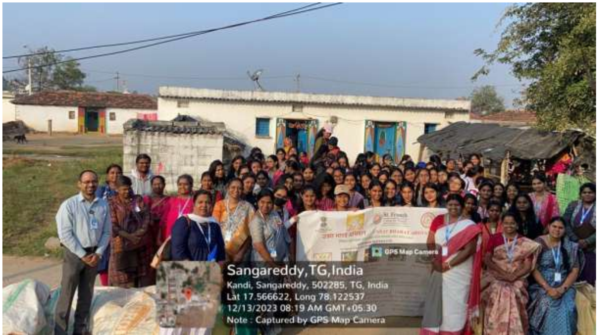
Sangareddy, TG, India Kandi, Sangareddy, 502285, TG, India Lat 17.566622, Long 78.122537 12/13/2023 08:19 AM GMT+05:30 Note : Captured by GPS Map Camera