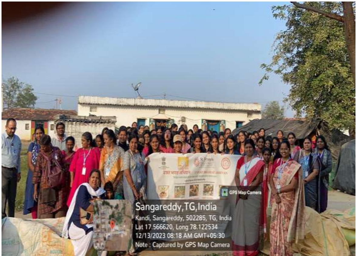
Sangareddy, TG, India Kandi, Sangareddy, 502285, TG, India Lat 17.566620, Long 78.122534 12/13/2023 08:18 AM GMT+05:30 Note : Captured by GPS Map Camera