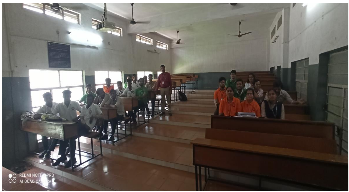
✓ Data Collection of school drop-outs and motivating them to re-enroll in schools in distance mode .etc