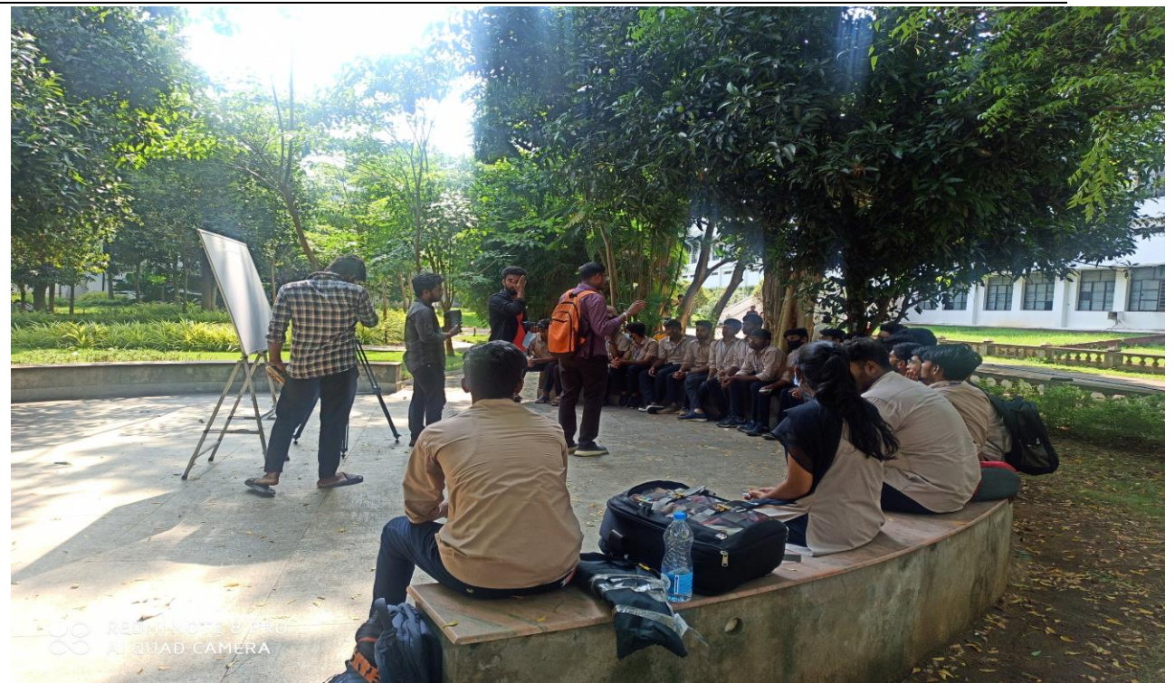
Explain Govt Schemes like "AmmaVadi ", Nadu-Nedu, ITI, Polytechnic, Engineering, Medicine, Pharmacy,