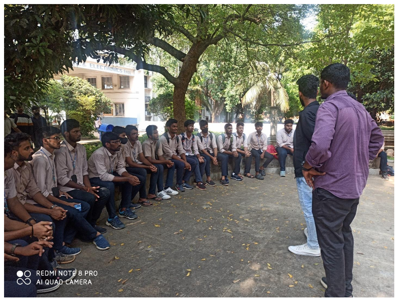
Sample pics on awareness programmes