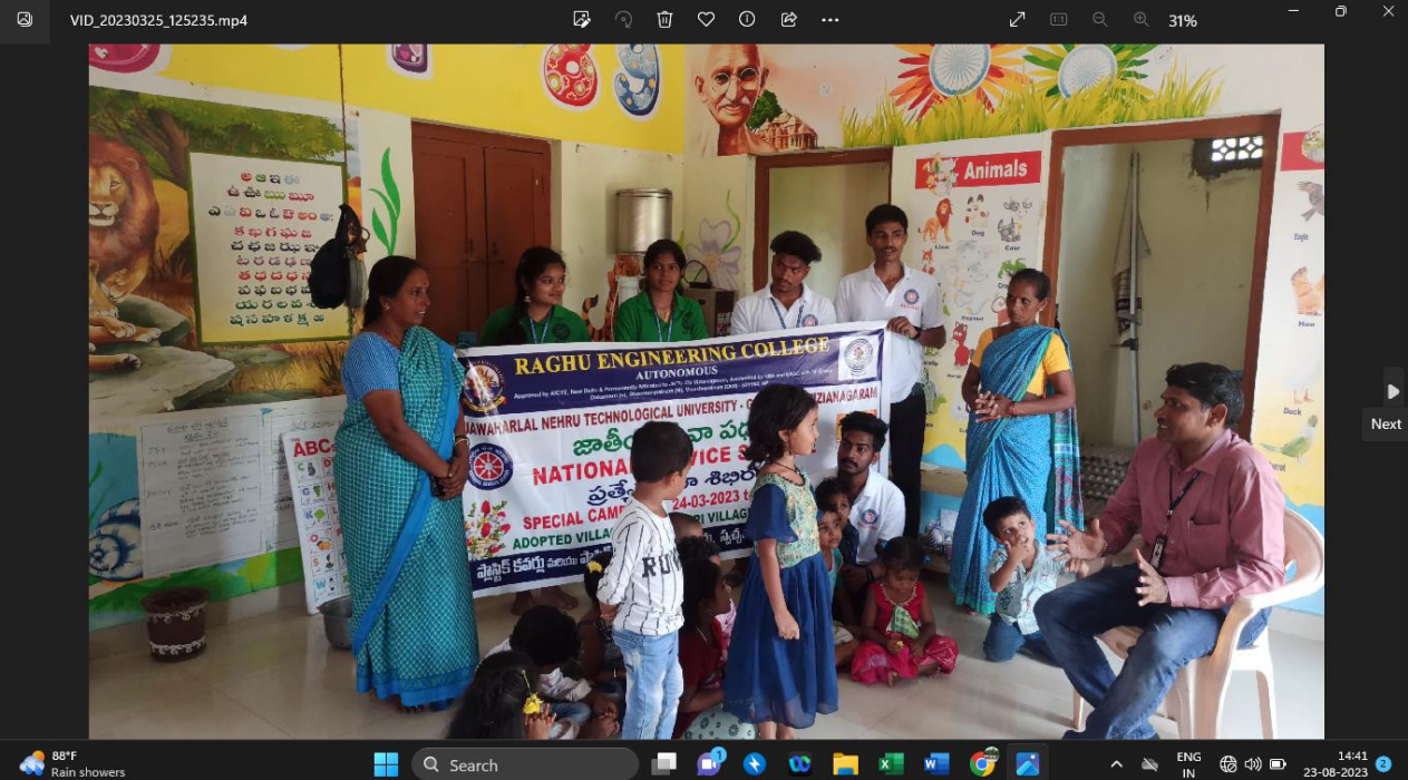
Message by Programme officer to children at anganivadi school