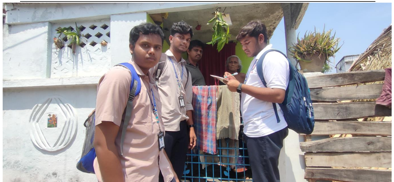
Door to door survey by NSS Volunteers