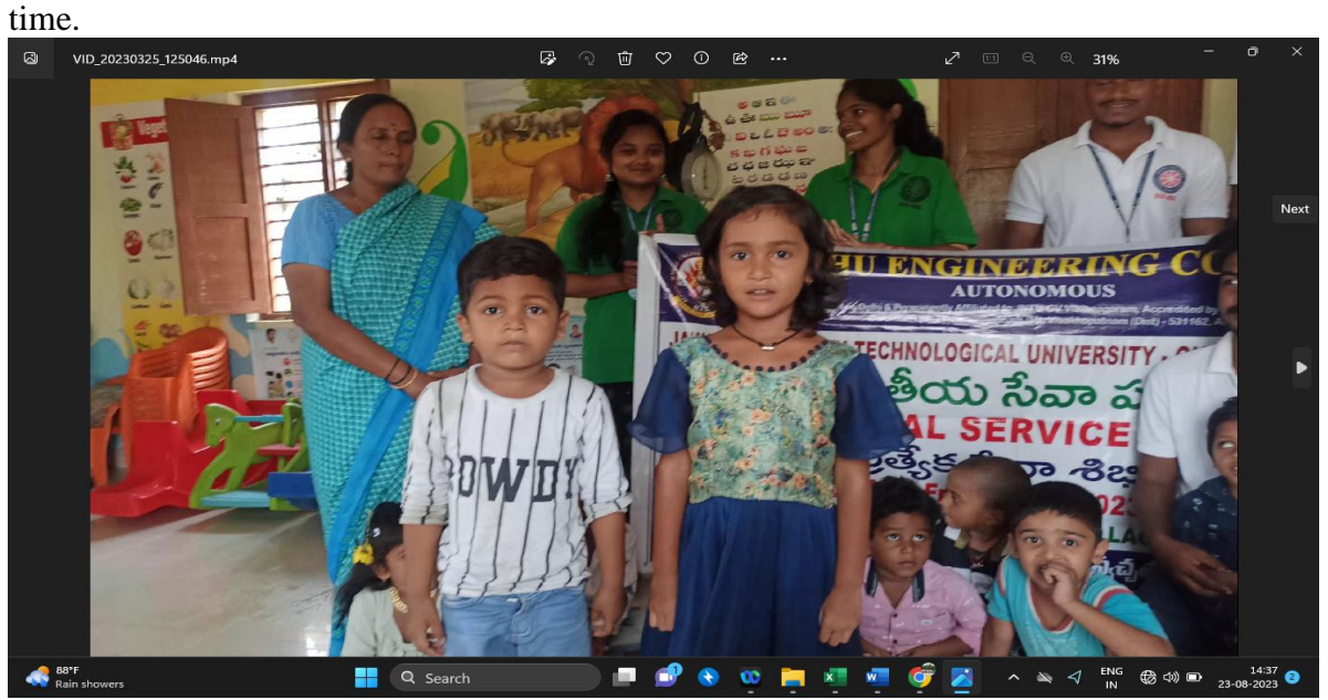
songs competition by Angannivadi school children