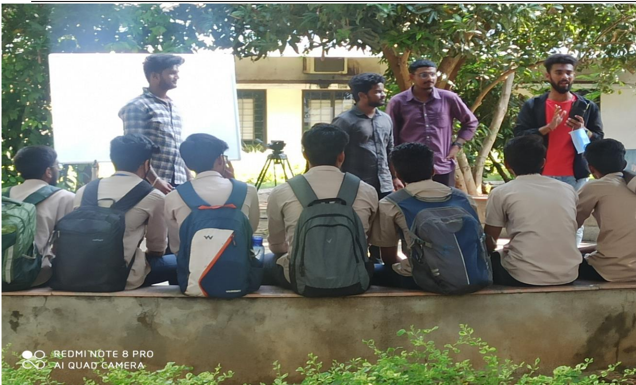
Day-5 : SKILL INDIA-Digital Literacy :