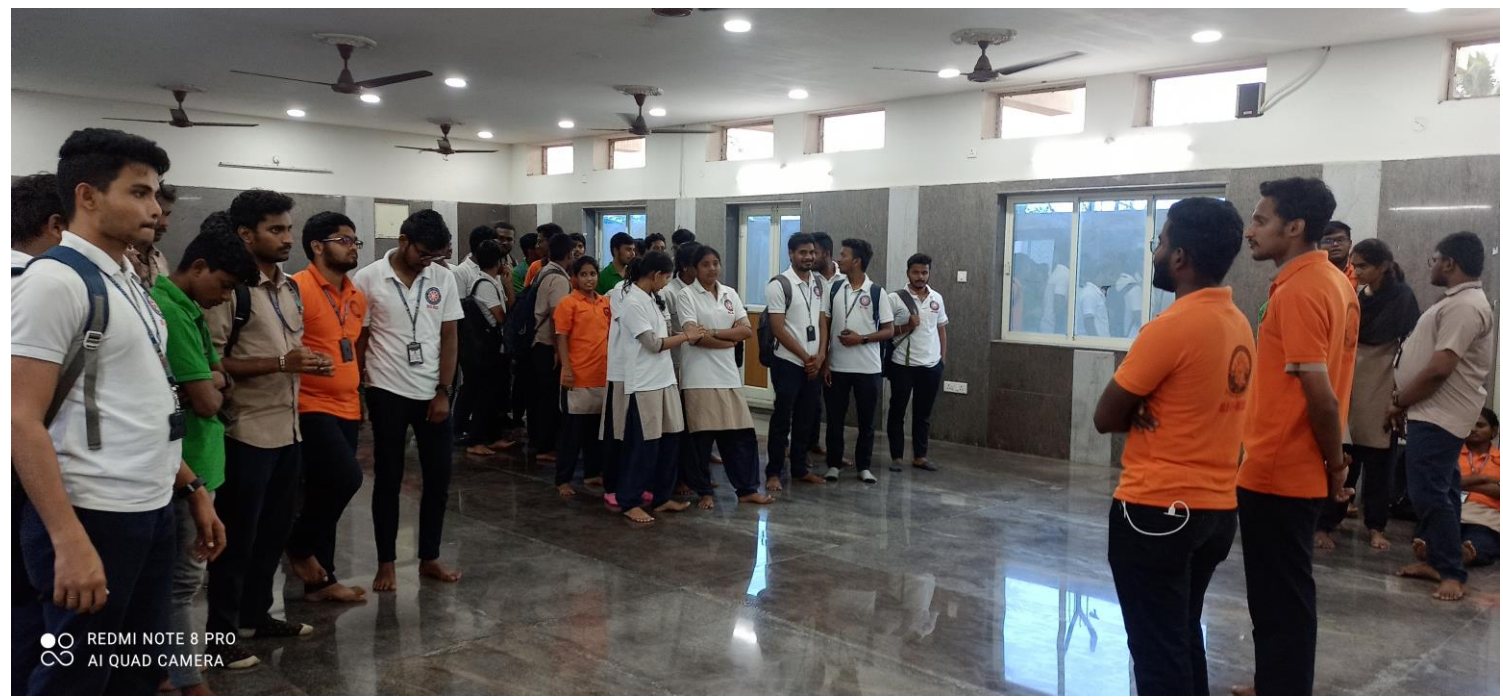
✓ Registration process Aadhar updation and PAN, Etc