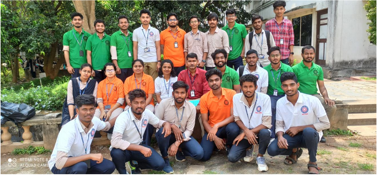
Formation of human chain and taking Pledge on Ethical voting

To motivate the villagers to enroll their names in the voters list .