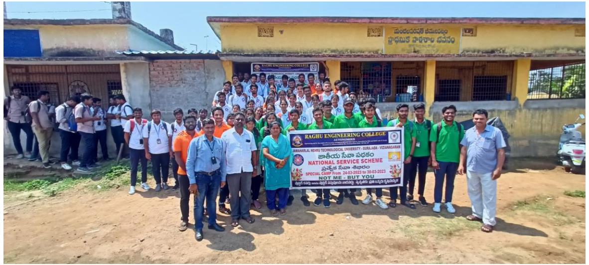
NAME OF THE ADOBTED VILLAGE: Dakamarri Village, Bheemili, VISAKHAPATNAM DISTRICT, AP..