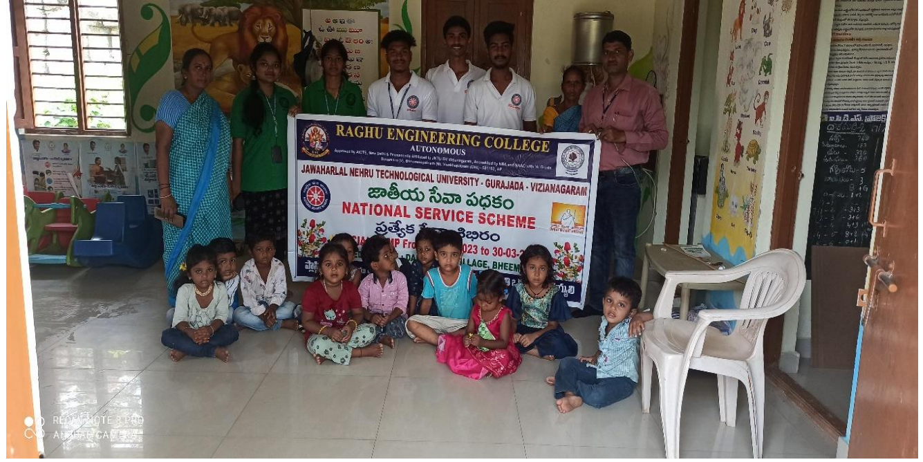
Angannivadi school children interaction at adopted village dakamarri