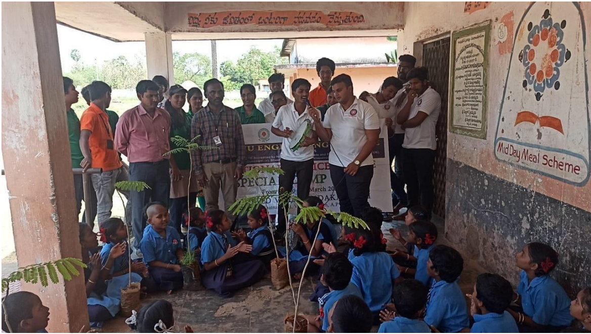
Cultural Programs with school Students and Explained about UBA