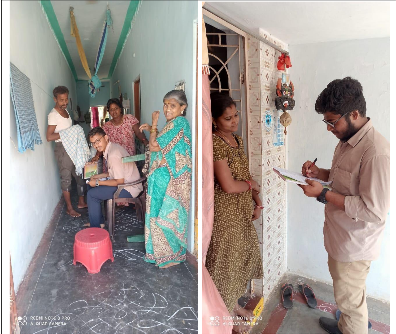
Door to door survey from korada villagers