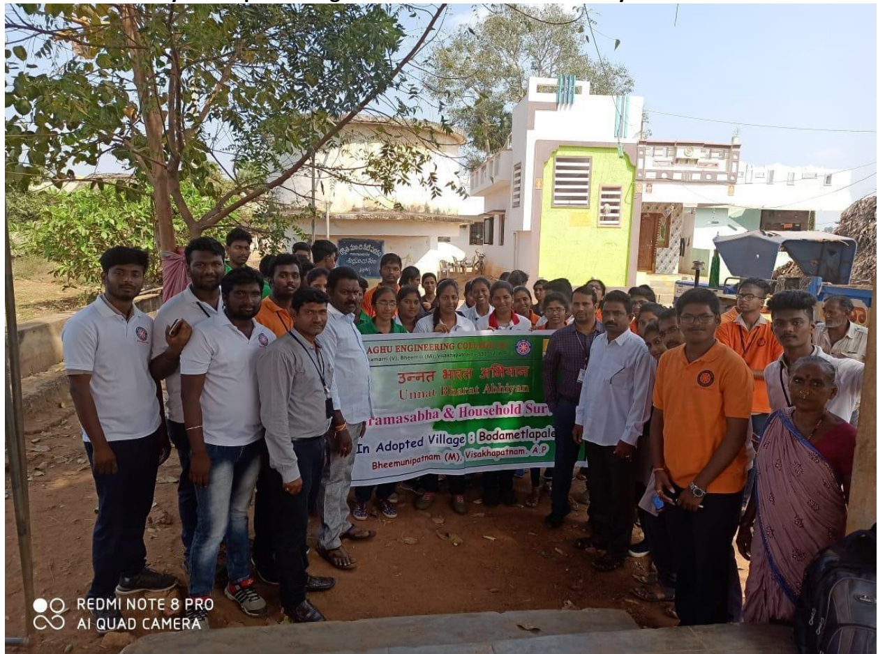
GramaSabha and Rally At BodamettaPalem Village , Bheemunipatnam, Visakhapatnam,AP, Under UBA regular activities 2019-20 by Raghu Engineering College(A)-PI on 13-03-2020.