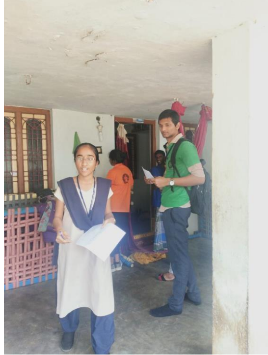
Door to door survey at adopted village AMANAM by UBA Team