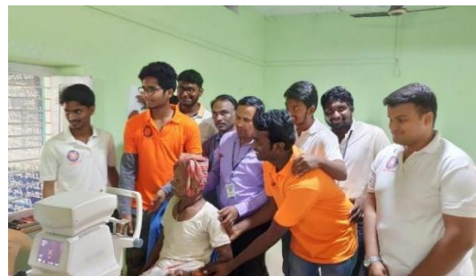
Eye check-up camp and Data collection at Dakamarri village , Bheemunipatnam, Visakhapatnam