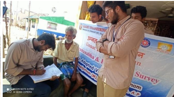
Door to door survey at adopted village AMANAM