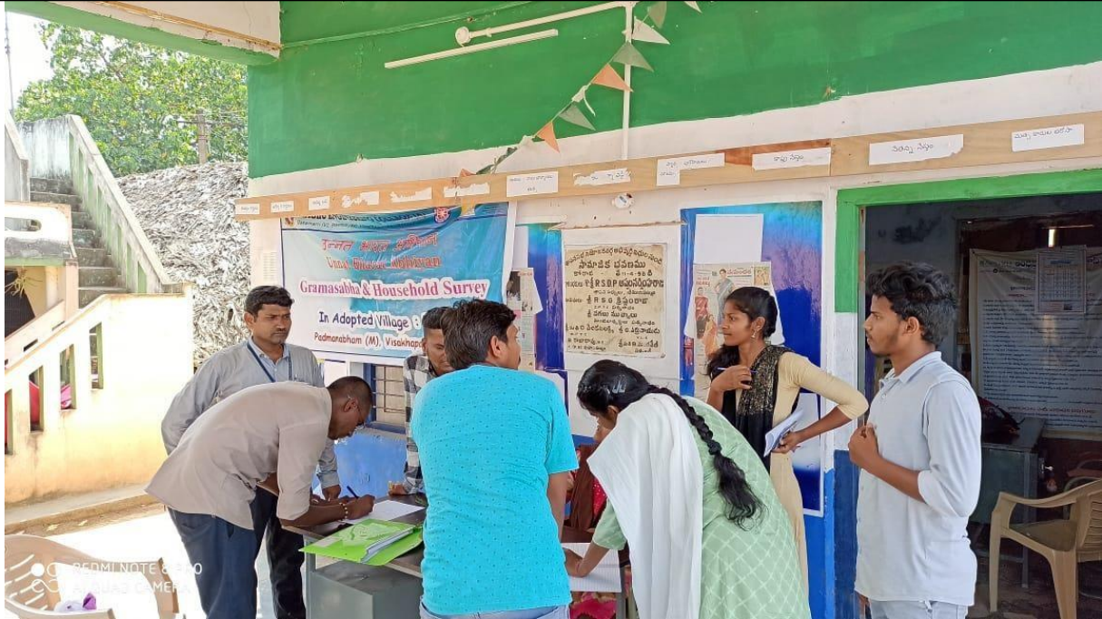
Data collected from villagers using UBA survey forms at Grama Sachwalayam