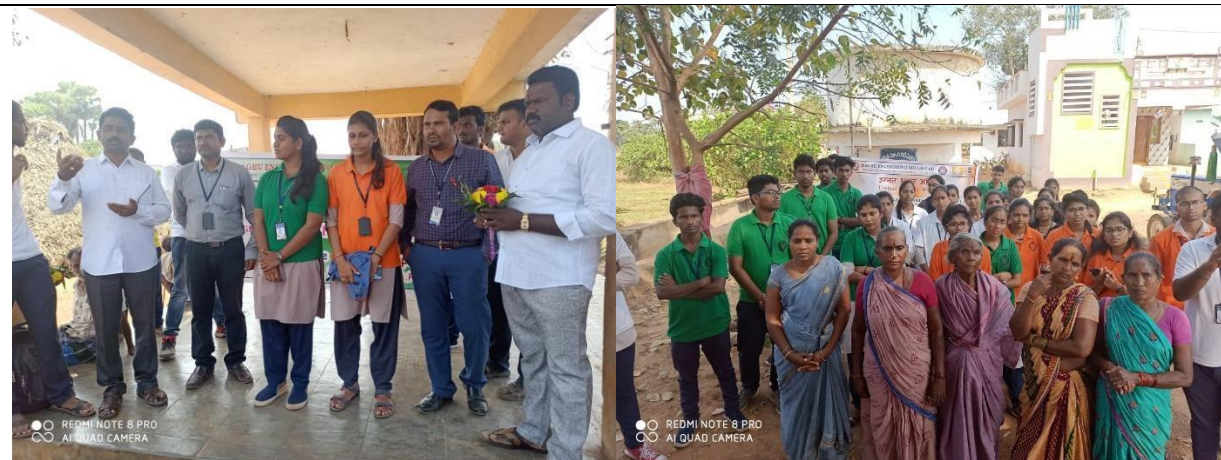
Gramasabha At BodamettaPalem Village , Bheemunipatnam, Visakhapatnam,AP Under UBA regular activities 2019-20 by Raghu Engineering College(A)-PI..

After that our students went door to door to collected data by household survey forms and interacted villagers and school children with various activities