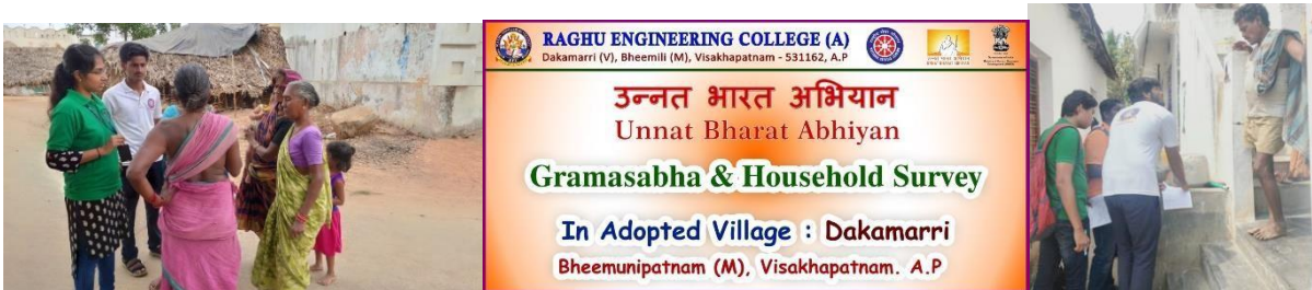
Interaction with villagers and Data survey from villagers