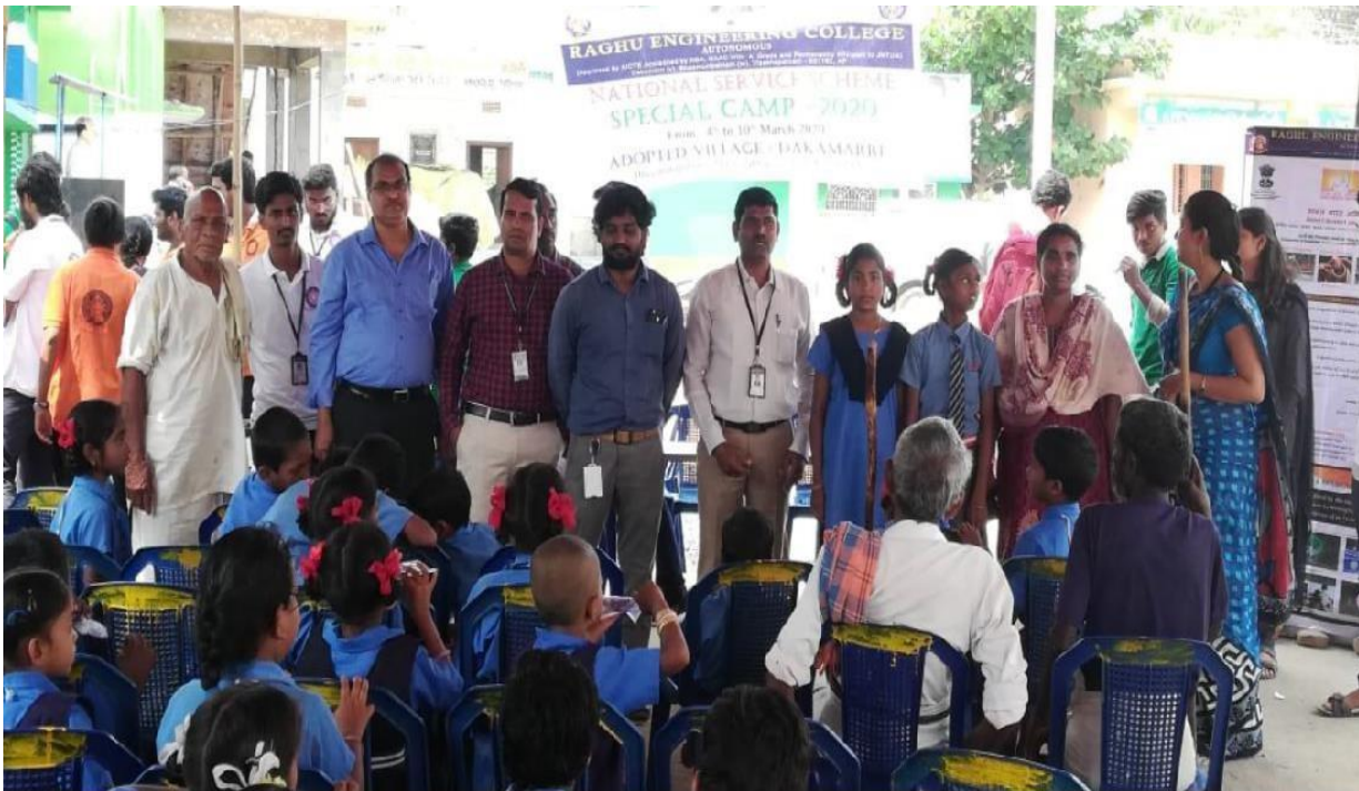
GramaSabha At Dakamarri Village , Bheemunipatnam, Visakhapatnam,AP Under UBA regular activities 2019-20 by Raghu Engineering College(A)-PI..

UBA-UNNAT BHARAT ABHIYAN of Raghu Engineering College(A)-Participating Institute, Visakhapatnam, Andhrapradesh organised regular activities in adopted village i.e. Dakamarri for 6 Days in association with NSS Unit from 4th March to 10th March 2020. The total number of student volunteers participated in this camp was 59. During this period the unit performed various activities in the village such as –Gramasabha, door to door Survey on Problems and Geological Development of the Village, Rally on Cleanliness, Sports Ground Preparation, Tree Plantation, Free Eye Check-up Camp, Awareness Program among School Children, Awareness for Organic Farming & Literacy and Community Development interactions