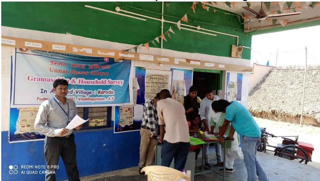
Data collected from Grma Sachiwalayam Staff using UBA survey forms