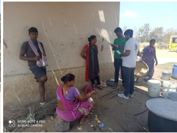
House hold survey at adopted village Grama Sachivalayam and interaction with workers for collecting data using UBA survey forms.