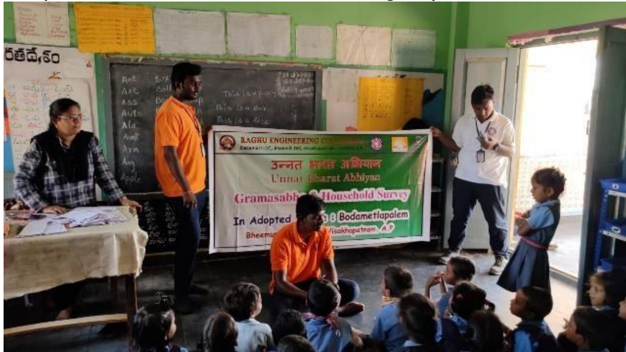
Interaction with school children and teachers and also explained cleanliness