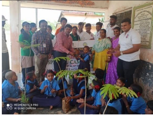
Distribution of plants to school teachers and Students of Adopted village i.e. Dakamarri