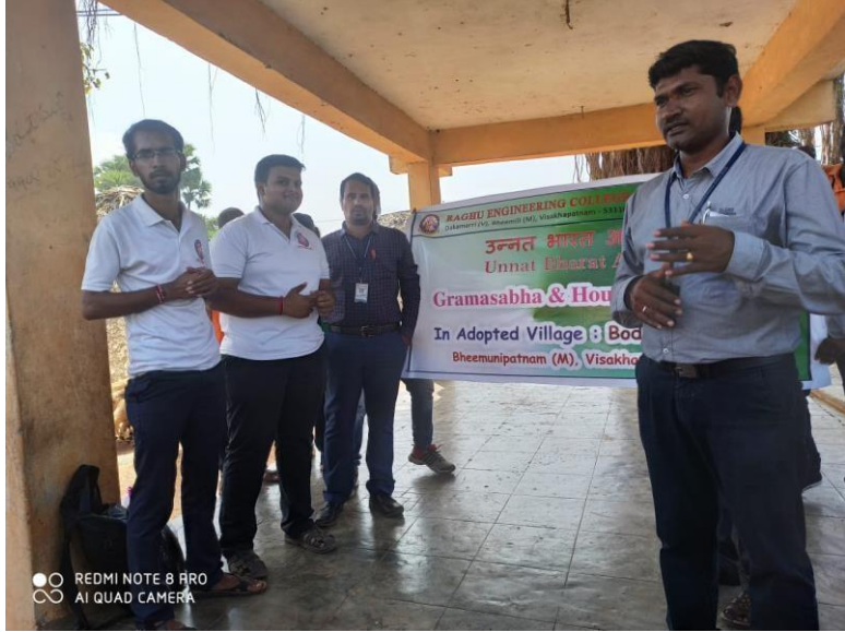
Explanation about UBA vision and mission to villagers by volunteers and faculties