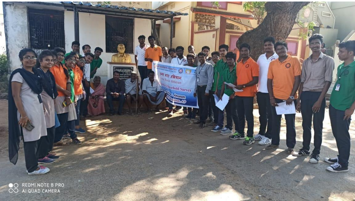
Adopted village : AMANAM-Bheemunipatnam(Manadal), Visakhapatnam, A.P

Raghu Engineering college(PI) , conducted GramaSabha and Household Survey and Rally at adopted village i.e. AMANAM Village , Bheemunipatnam-Manadal, Visakhapatnam-District, A.P., in this program some of the villagers are participated and given some inputs to our UBA team. The Panchayathi Staff discussed various problems of the village. UBA team explained a about Rural Development and vision and mission of UBA . villagers requested to provide better the solutions to specified problems as early as possible in the adopted village . After that our students collected data door to door by household survey forms of UBA.