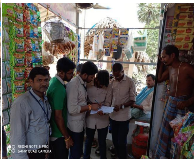
Door to door Survey at B.R.Talavalasa Village , Padmanabham Visakhapatnam, A P, Under UBA regular activities 2019-20 by Raghu Engineering College(A)-PI.