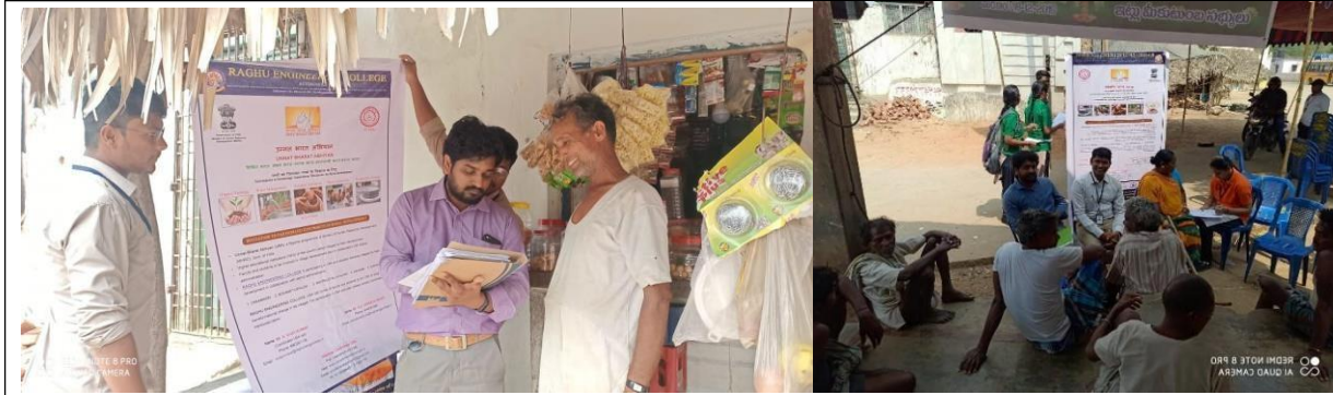
Door to door survey at Dakamarri village and Explain vision and mission of UBA to villagers