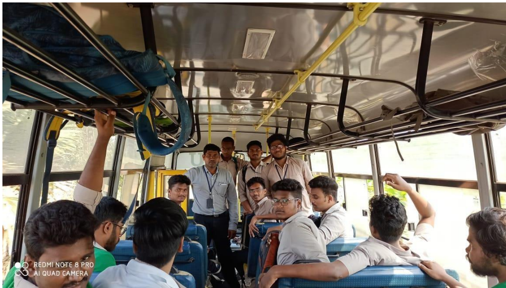
Bus Journey from Raghu Engineering College to Adopted village Korada with students