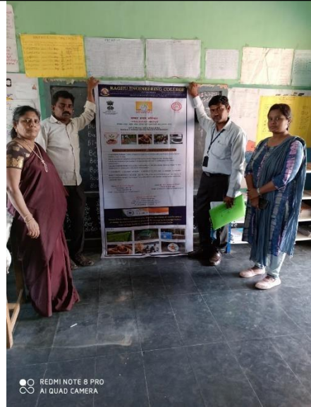
House hold survey at adopted village and interaction with Primary School Teachers & PS