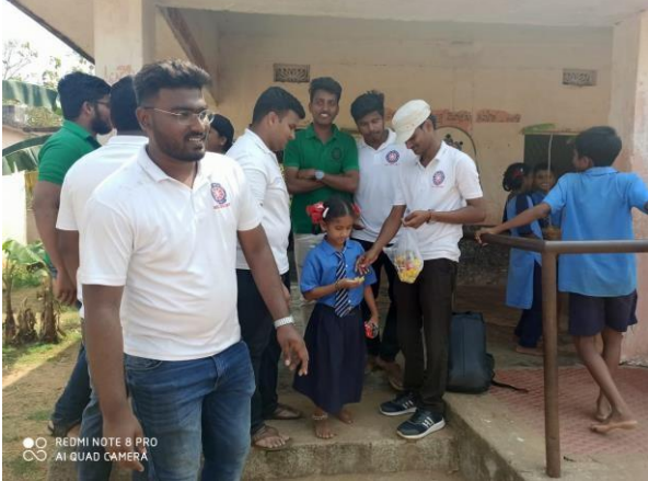
Yoga classes to school students and Sweets Distribution to Students