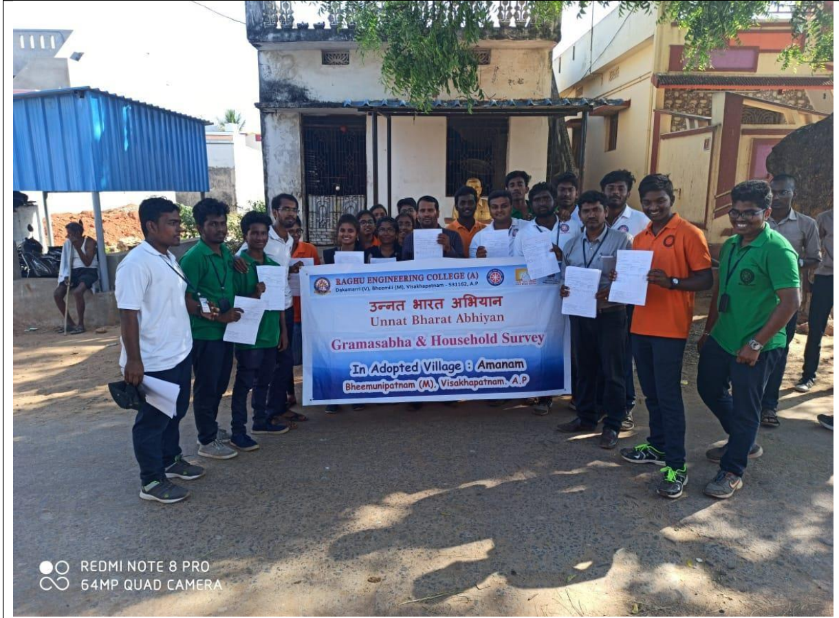
Rally at adopted village AMANAM and Completed survey as per Specifications