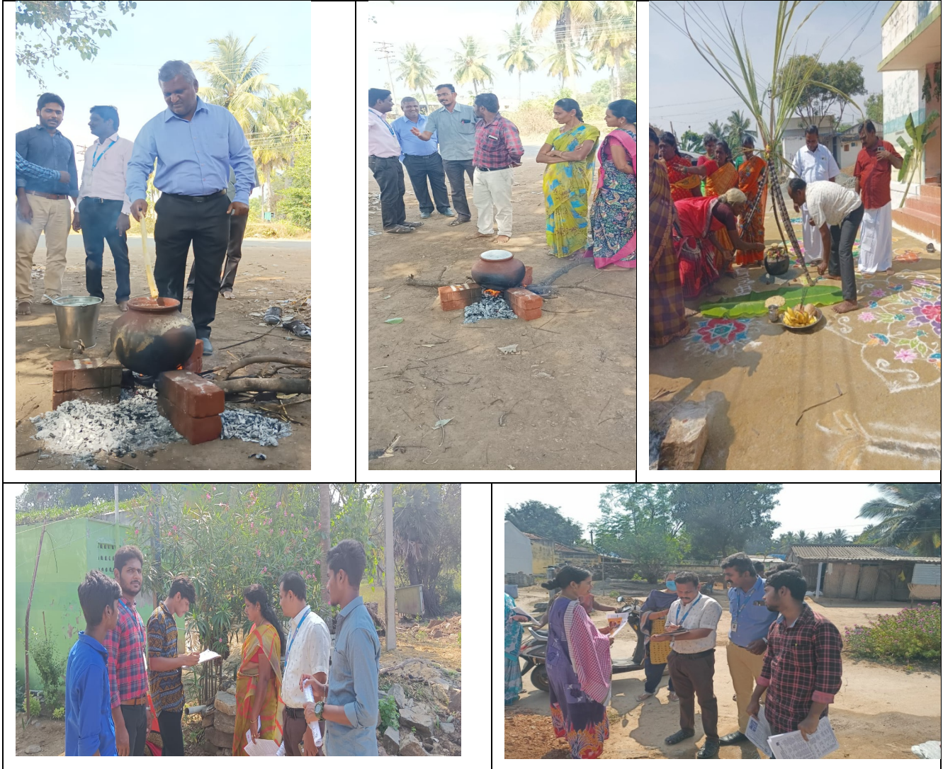
Palamedu Village Panchayath Office and volunteers visiting households for the survey