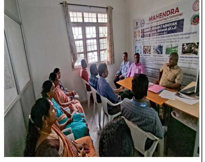
UBA Cell Executive Committee Meeting