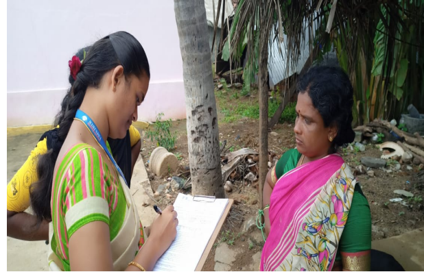
Senbagamadevi Village Panchayath Office and volunteers visiting households for the survey