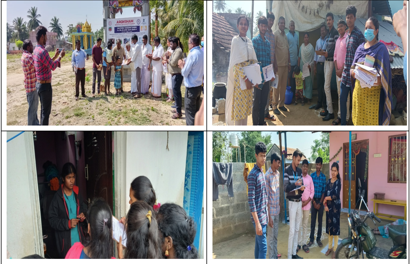
Mallasamudram West Village Panchayath Office and volunteers visiting households for the survey