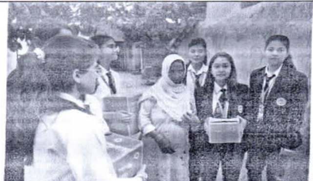
AWARENESS PROGRAM ON HYGIENIC FACTORS OF HUMAN HEALTH CONDUCTED ON 04.02.2020 at Sahaspur