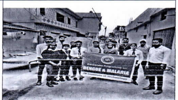
AWARENESS PROGRAM ON DENGUE AND MALARIA CONDUCTED ON 29.11.2019 AT LAXMIPUR