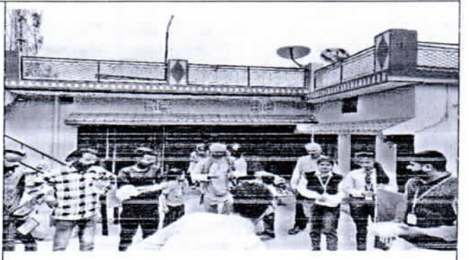
AWARENESS PROGRAM ON DENGUE AND MALARIA CONDUCTED ON 29.11.2019 AT LAXMIPUR