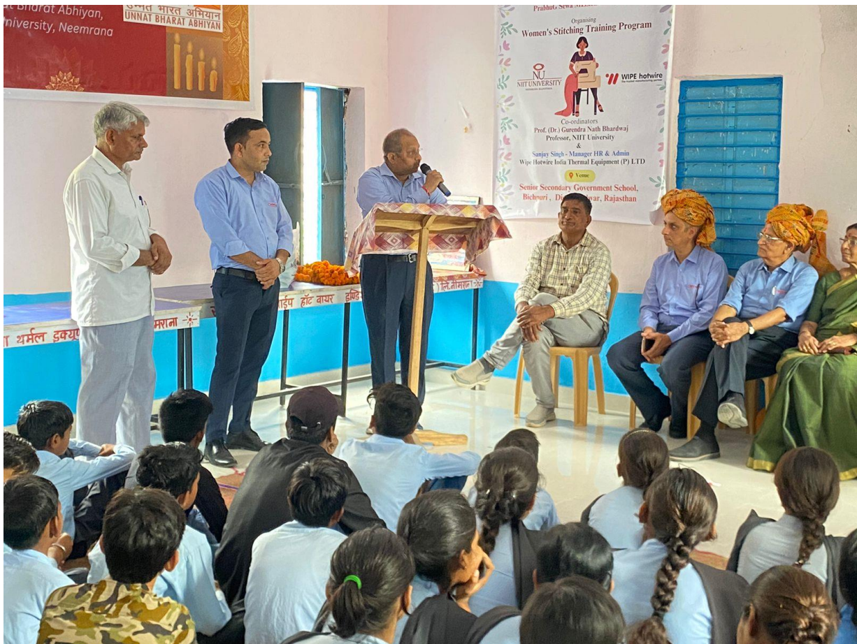
On August 3, 2024, with the help of PrabhuG Sewa Mission Foundation, the Sewing Machine sponsored by Wipe Hot Wire has been installed.