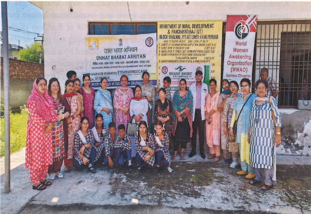
A group photograph Sarpanch, WWAO team, Sharp Sight Eye Hospital team along with students