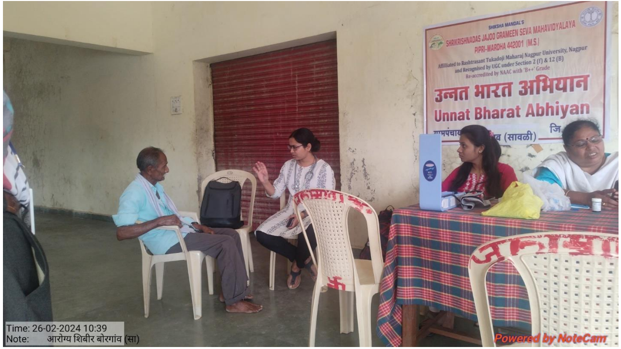
Time: 26-02-2024 10:39 Note: आरोग्य शिबीर बोरगांव (सा)