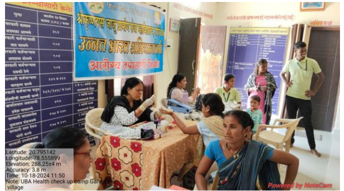
Latitude: 20.795142 Longitude: 78.555999 Elevation: 288.2544 m Accuracy: 3.8 m Time: 10-18-2024 11:50 Note: UBA Health check up camp Ganeshpur village