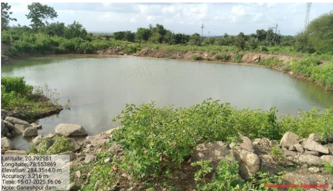
water conservation situation in July 2025