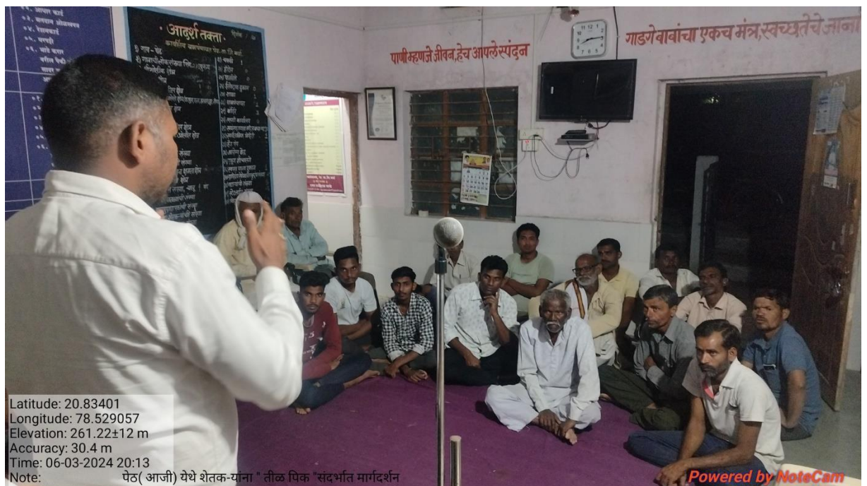
Farmers participated in the programme