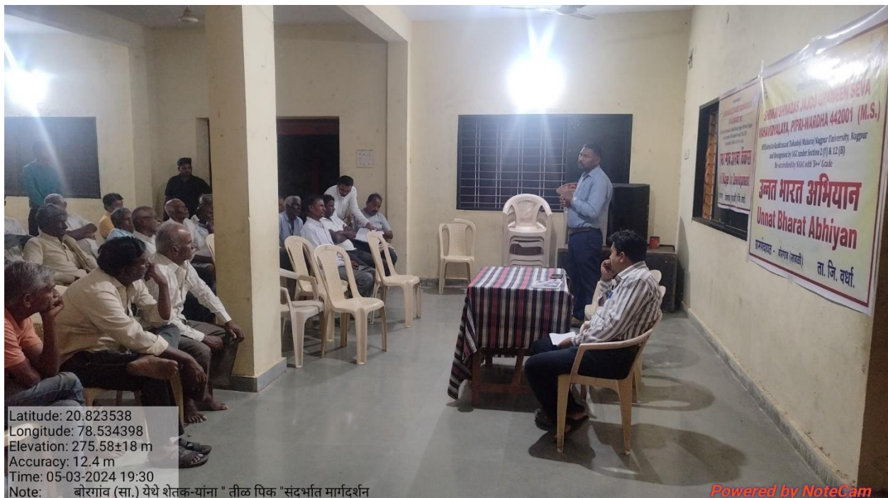
Farmers participated in the programme