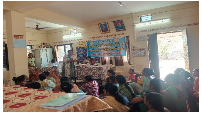
Doctors guiding anaemic patients