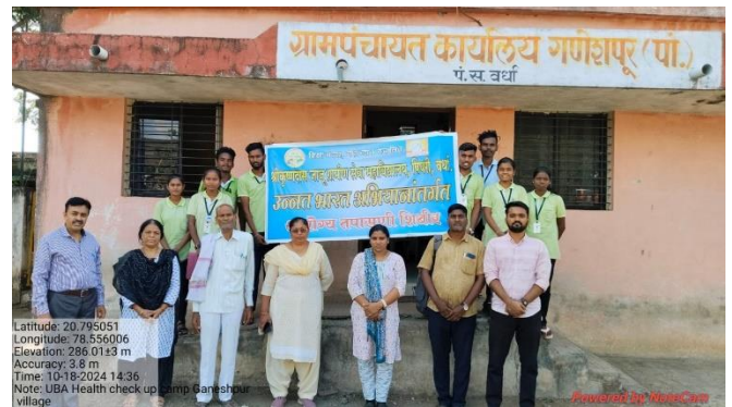
Latitude: 20.795051 Longitude: 78.556006 Elevation: 286.0113 m Accuracy: 3.8 m Time: 10-18-2024 14:36 Note: UBA Health check up camp Ganeshpur village