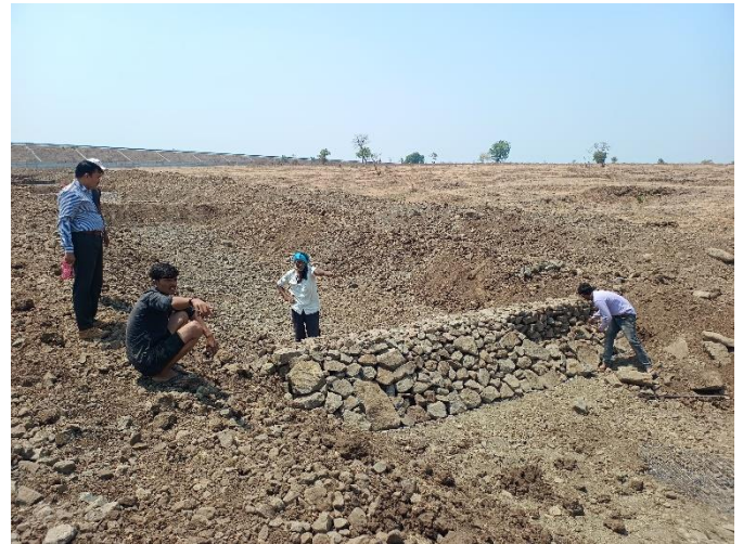
Gabion weired bunds constructed