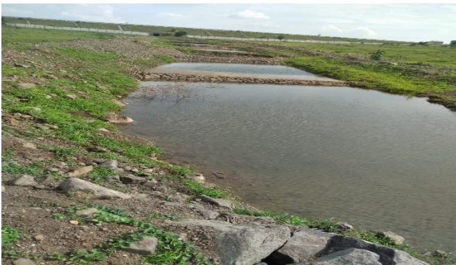
water conservation situation in June 2025