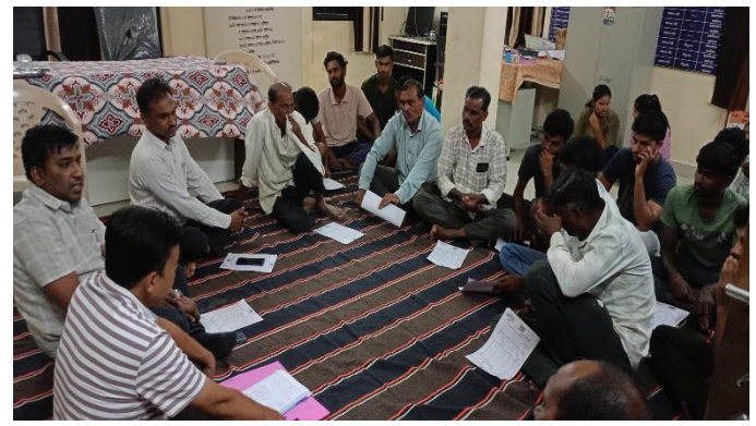
Farmers interacting with experts