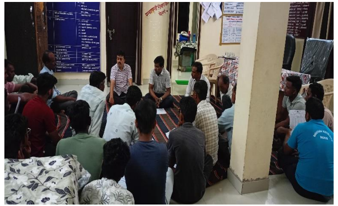
Soil Scientist guiding farmers