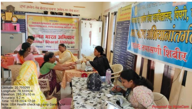
Latitude: 20.795099 Longitude: 78.555924 Elevation: 285.31110 m Accuracy: 9.2 m Time: 10-18-2024 12:38 Note: UBA Health check up camp Ganeshpur village