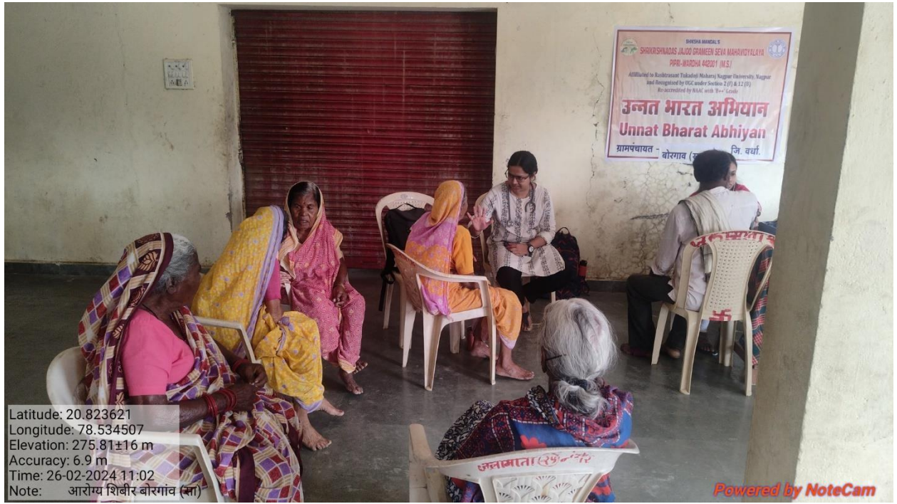
Latitude: 20.823621 Longitude: 78.534507 Elevation: 275.81±16 m Accuracy: 6.9 m Time: 26-02-2024 11:02 Note: आरोग्य शिबीर बोरगांव (सा)