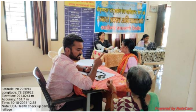
Latitude: 20.795093 Longitude: 78.555922 Elevation: 291.0244 m Accuracy: 161.7 m Time: 10-18-2024 12:38 Note: UBA Health check up camp Ganeshpur village