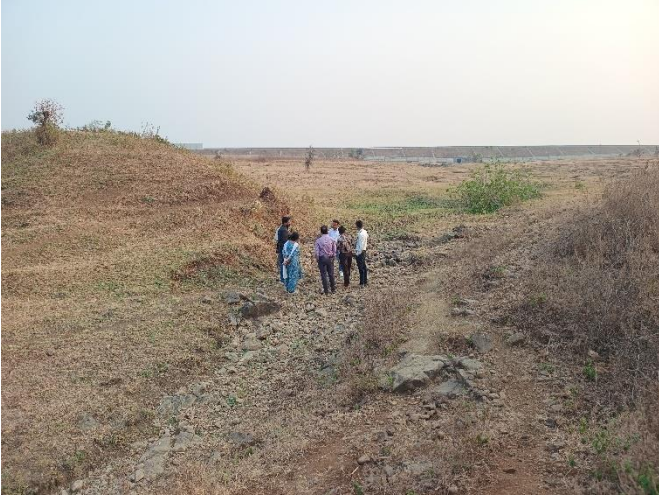
Site visit of Forest Officer and UBA Team