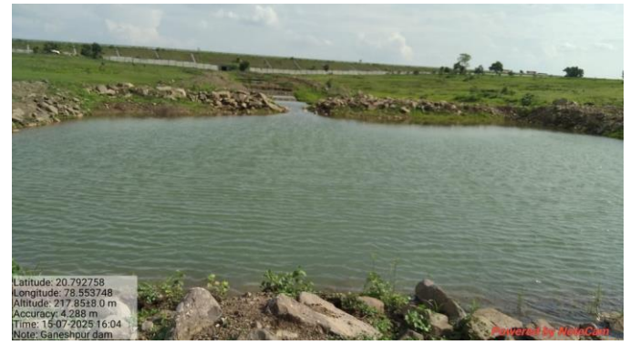
water conservation situation in July 2025