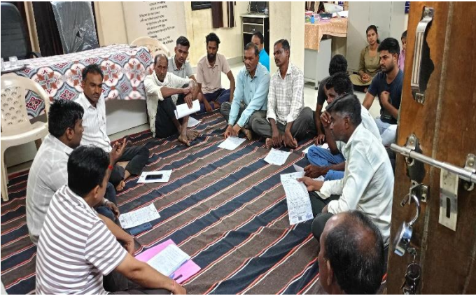
Soil Scientist guiding farmers

Technical Guidance to Farmers for Crop Planning based on Soil sample reports