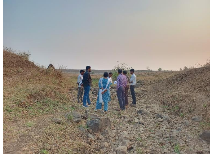
Site visit of Forest Officer and UBA Team