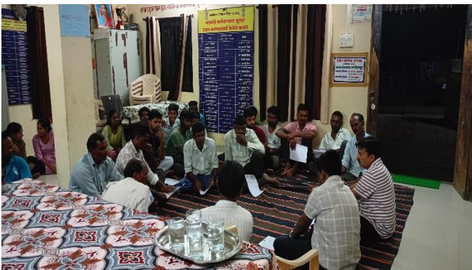
Farmers interacting with experts