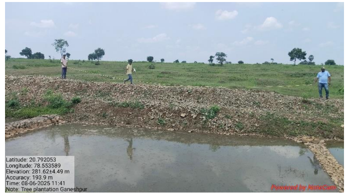
water conservation situation in June 2025