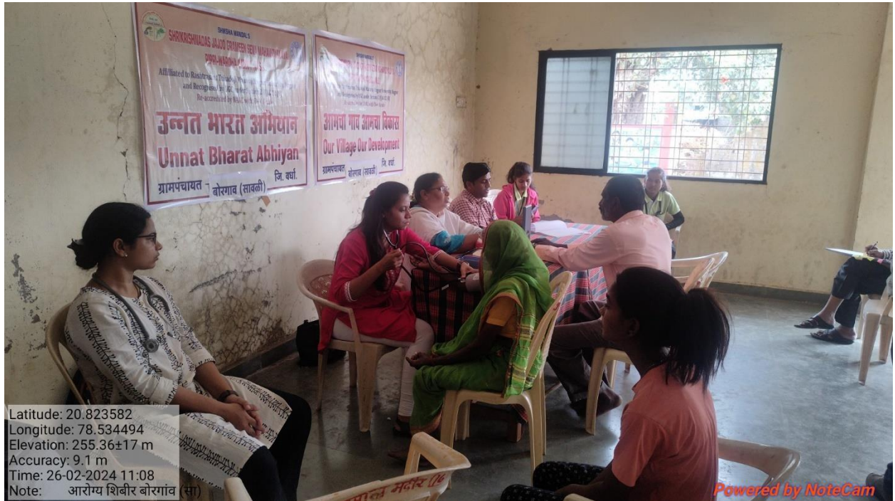
Health Check-up Camp at Borgaon (Sawali) Under Unnat Bharat Abhiyan Date : 26/02/2024