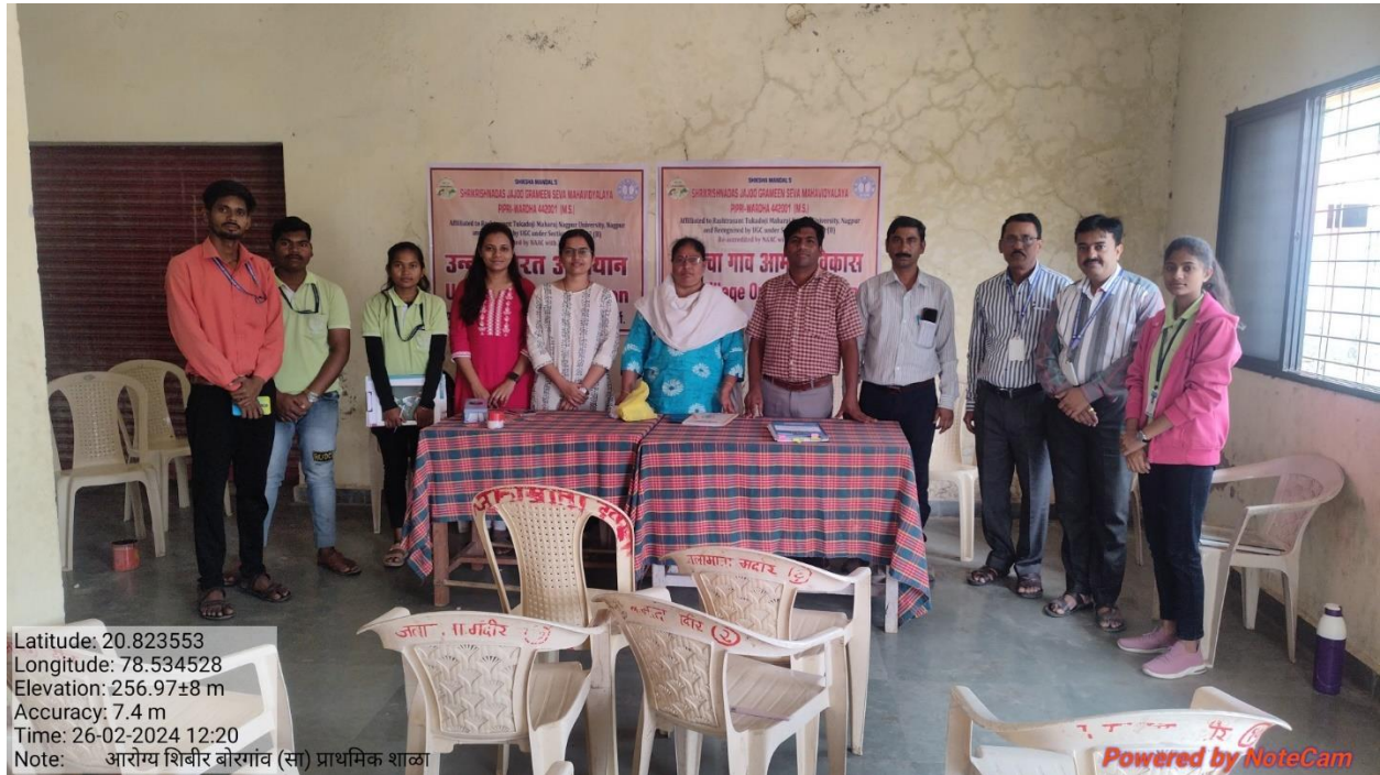
Health Check-up Camp at Borgaon (Sawali) Under Unnat Bharat Abhiyan Date : 26/02/2024