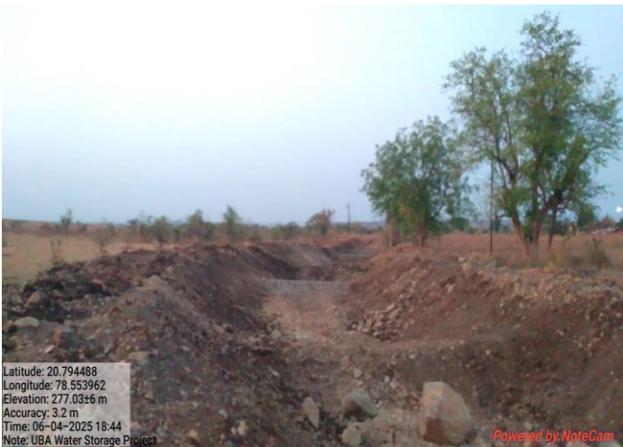
Gabion bunds constructed