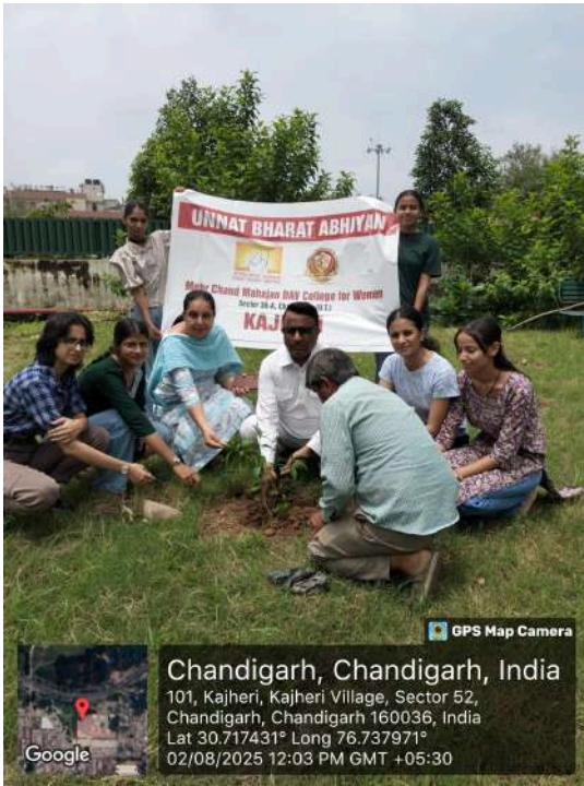
GPS Map Camera Chandigarh, Chandigarh, India 101, Kajheri, Kajheri Village, Sector 52, Chandigarh, Chandigarh 160036, India Lat 30.717431° Long 76.737971° 02/08/2025 12:03 PM GMT +05:30 Google