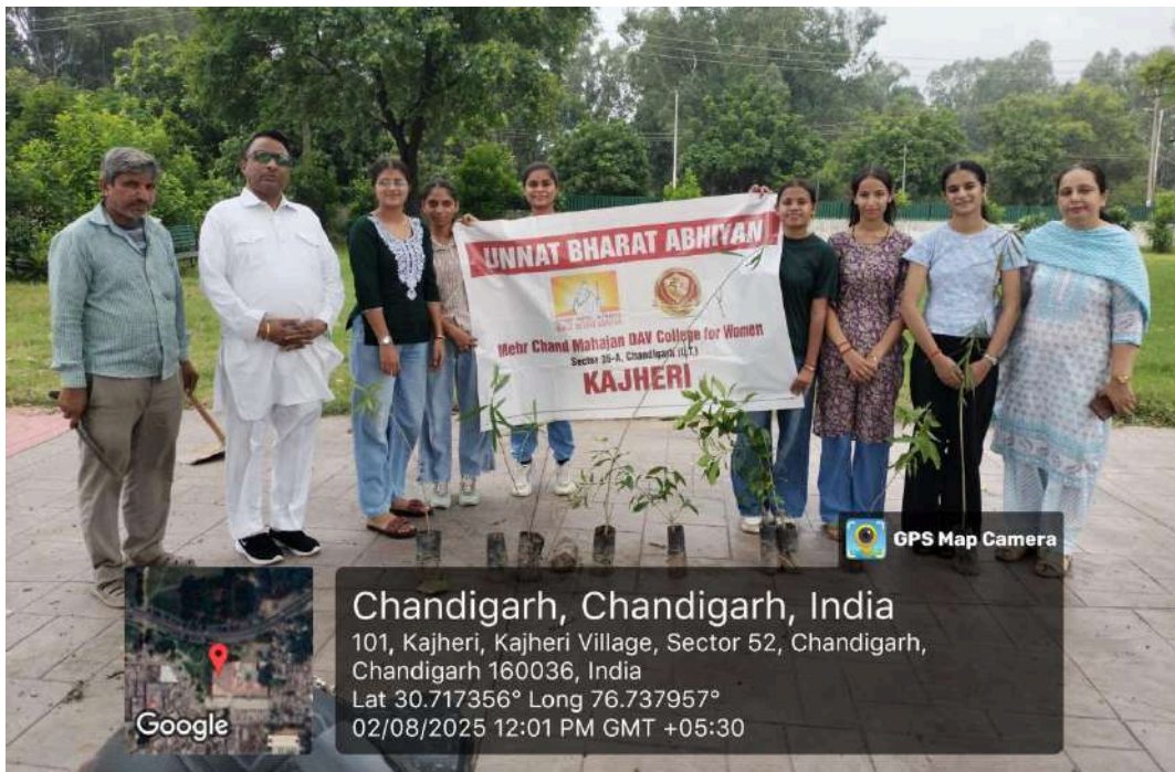
GPS Map Camera Chandigarh, Chandigarh, India 101, Kajheri, Kajheri Village, Sector 52, Chandigarh, Chandigarh 160036, India Lat 30.717356° Long 76.737957° 02/08/2025 12:01 PM GMT +05:30 Google