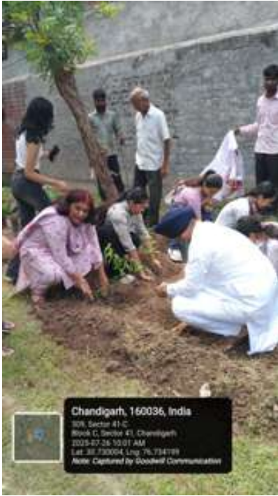
Chandigarh, 160036, India 309, Sector 41-C Block D, Smokey Hill, Chandigarh 2025-07-26 10:01 AM Lat: 30.733004, Long: 76.734199