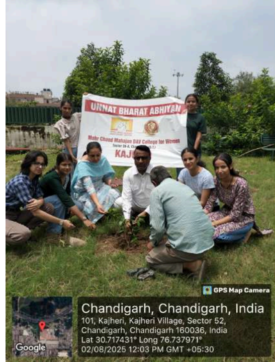
GPS Map Camera Chandigarh, Chandigarh, India 101, Kajheri, Kajheri Village, Sector 52, Chandigarh, Chandigarh 160036, India Lat 30.717431° Long 76.737971° 02/08/2025 12:03 PM GMT +05:30 Google