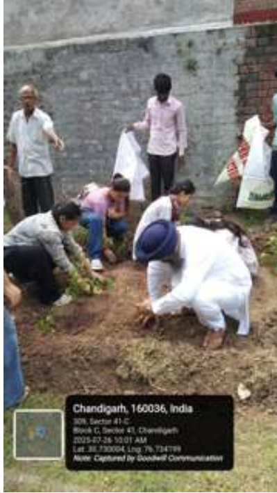
Chandigarh, 160036, India 309, Sector 41-C Block D, Smokey Hill, Chandigarh 2025-07-26 10:01 AM Lat: 30.733004, Long: 76.734199