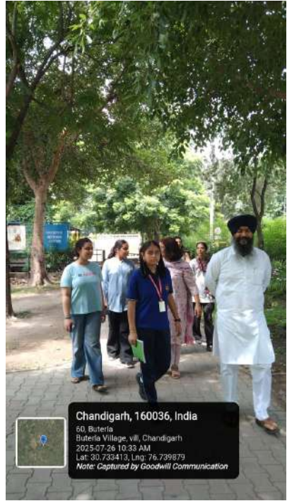
Chandigarh, 160036, India 60, Butera Butera Village, vill, Chandigarh 2025-07-26 10:33 AM Lat: 30.733413, Long: 76.739979