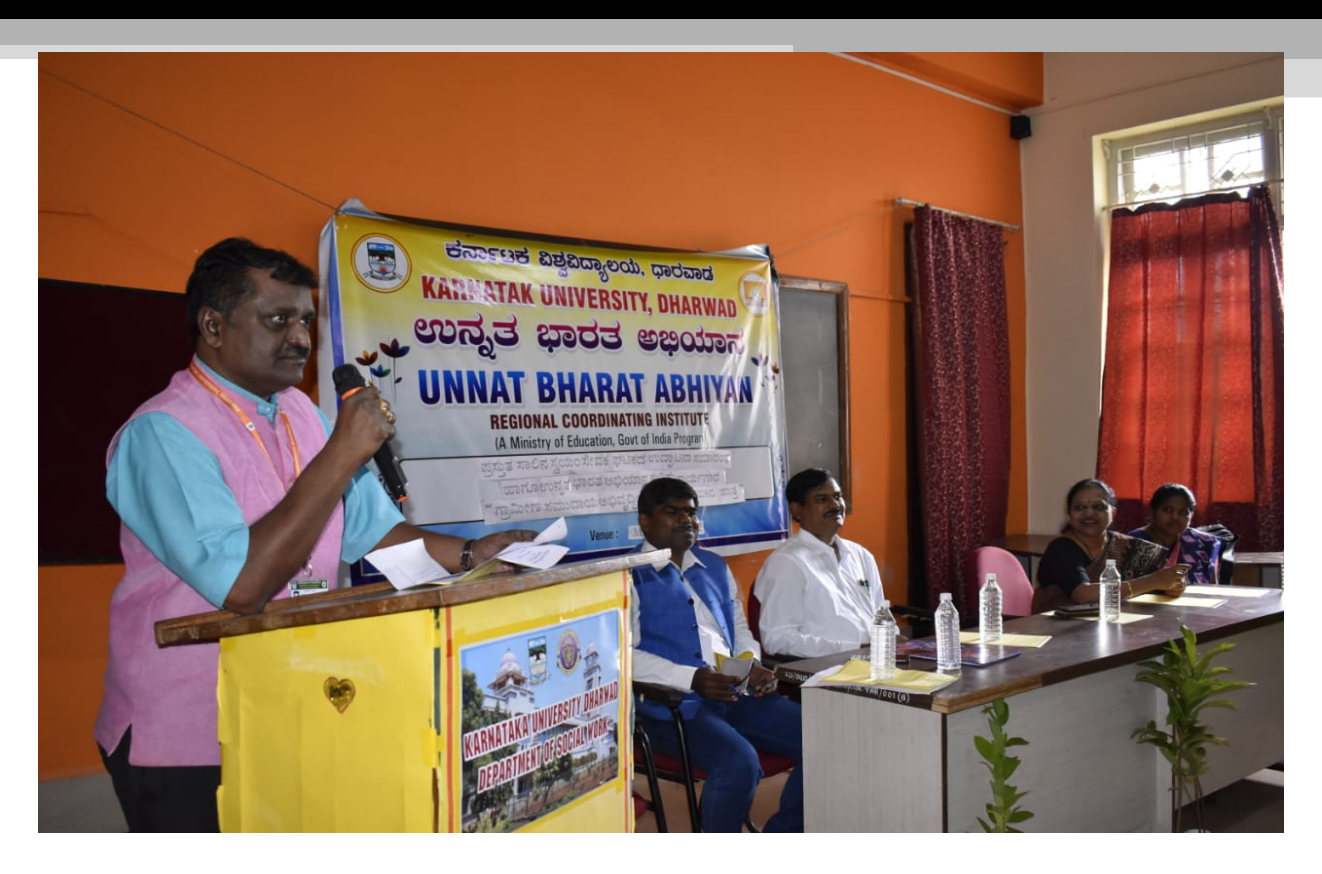
Valuable and Motivational speech by the Guests.