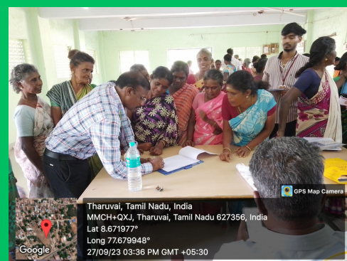
Meeting with MGNREGs workers regarding promotion of Rural Enterprises