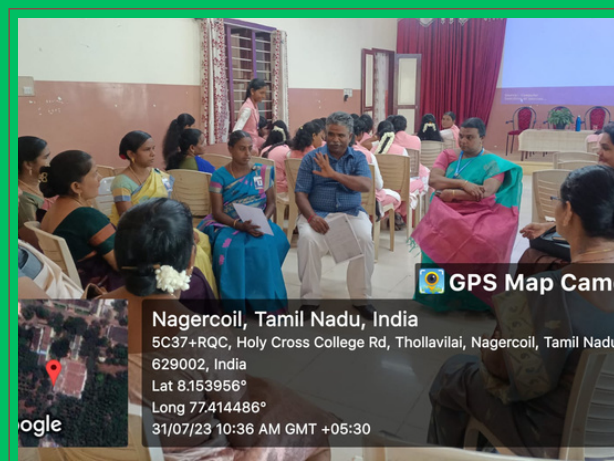
Workshop on GPDP at Holy Cross College, Nagercoil 31.7.2023