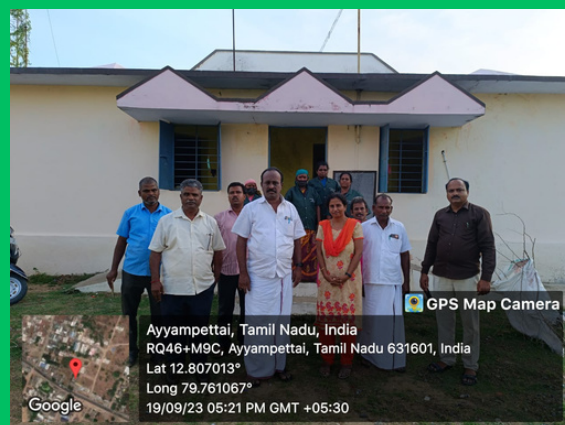
Field visit to Waste Plastic Shredder Ayyampettai Gram Panchayat