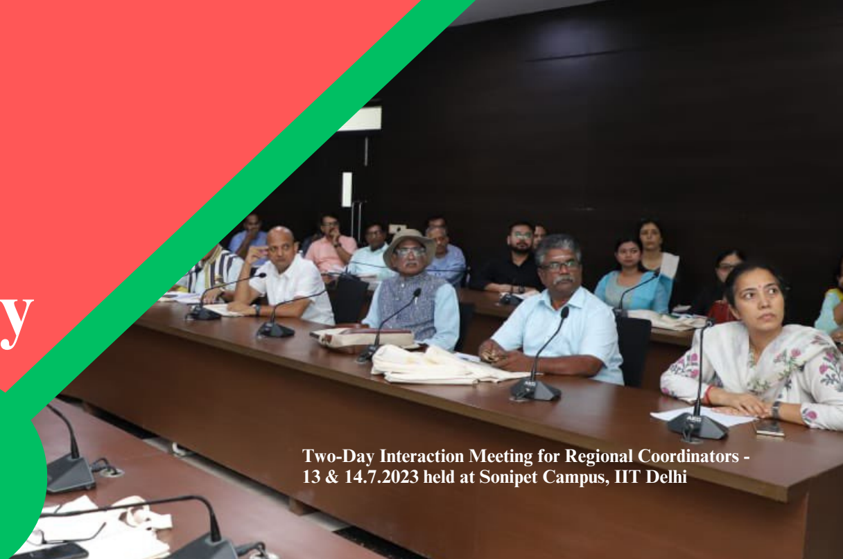
Two-Day Interaction Meeting for Regional Coordinators - 13 & 14.7.2023 held at Sonipet Campus, IIT Delhi