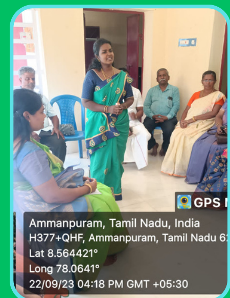
Meeting with members of Women SEGs for promoting Rural Enterprises