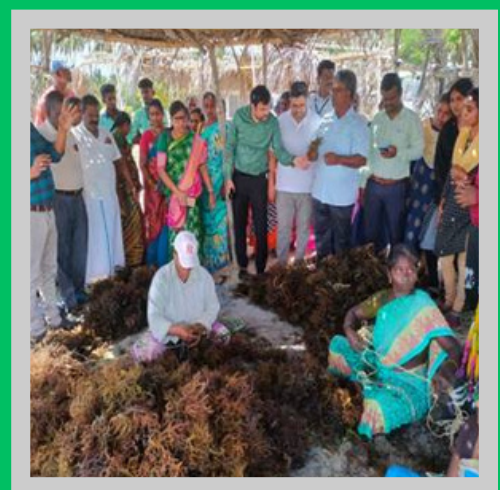
Field visit for interaction with the Seaweed cultivators at Mandapam