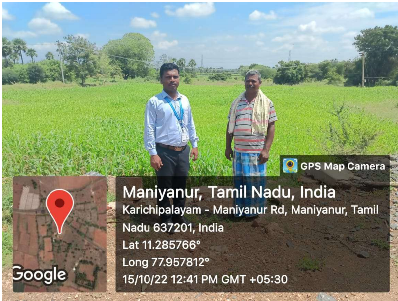
Visited Maniyanur Panchayath office to meet Panchayath President