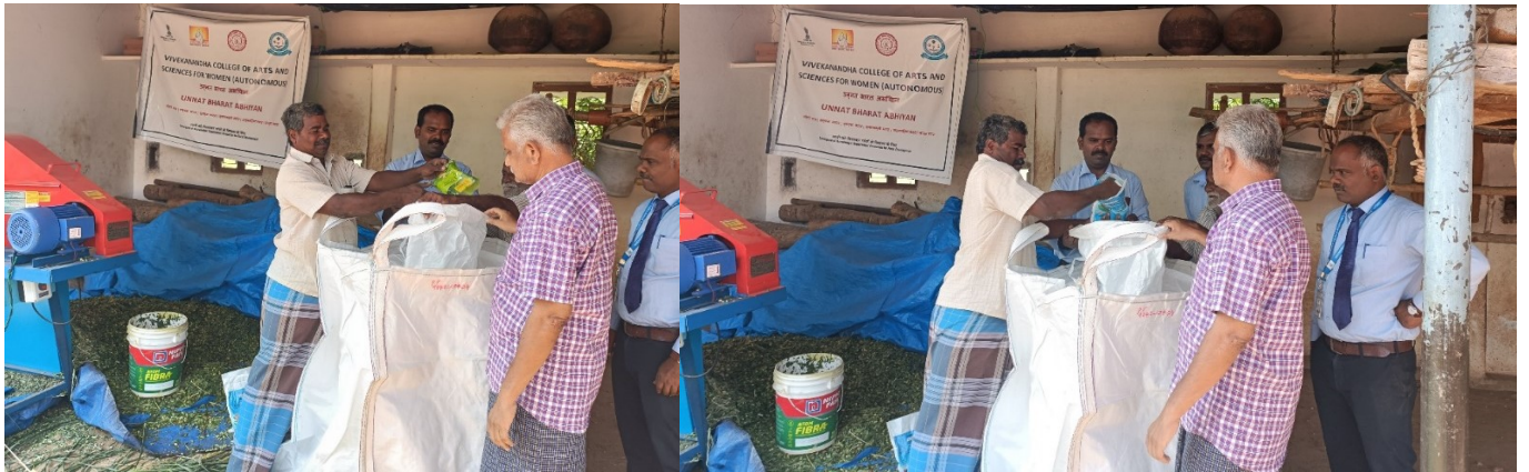
Health awareness programme conducted in UBA Adopted village