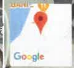
Inamkulathur, Tamil Nadu, India PH32+H22, Inamkulathur, Tamil Nadu 620009, India Lat 10.703825° Long 78.550002° 22/06/22 12:46 PM