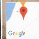
Inamkulathur, Tamil Nadu, India PH32+G42, Inamkulathur, Tamil Nadu 620009, India Lat 10.703644° Long 78.550277° 22/06/22 01:10 PM

PRINCIPAL AIMAN COLLEGE OF ARTS & SCIENCE FOR WOMEN TIRUCHIRAPPALLI-620 021.