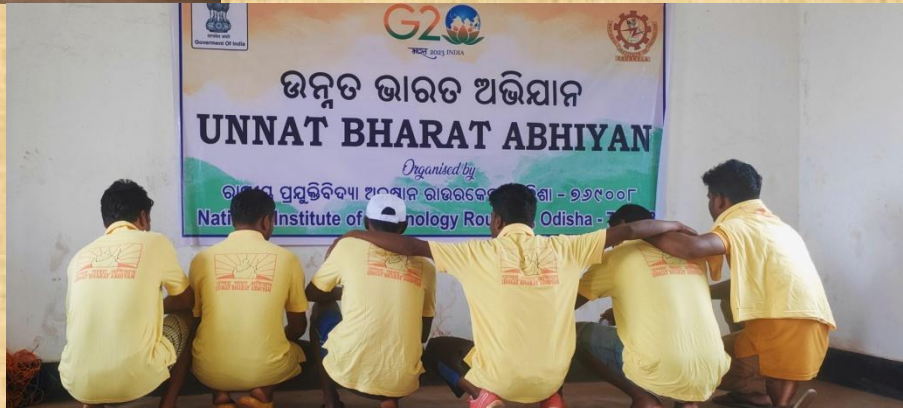
Volunteers of Jhirpani Under UBA NIT Rourkela