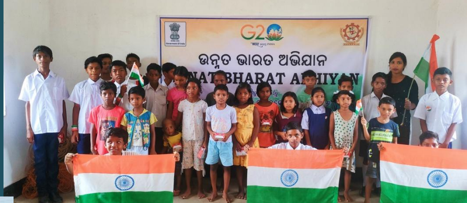
Kids of nearby schools with UBA NIT Rourkela team