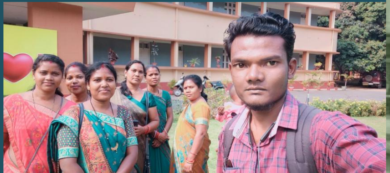
People of Dalposh in NIT Rourkela for Workshop on Skill Development 9 th March 23