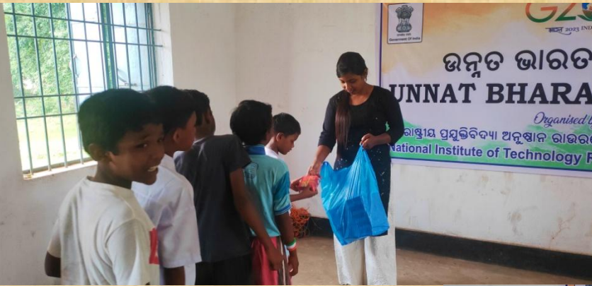
Distribution of sweets to kids of adopted village of Jhirpani