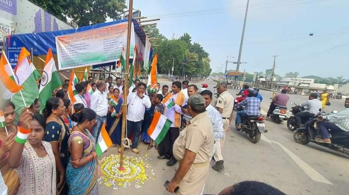
Flag hosting in DRDA square, Sundergarh by District Sarpanch Sangha ,Sarpanch of all villages under Sundergarh District were present