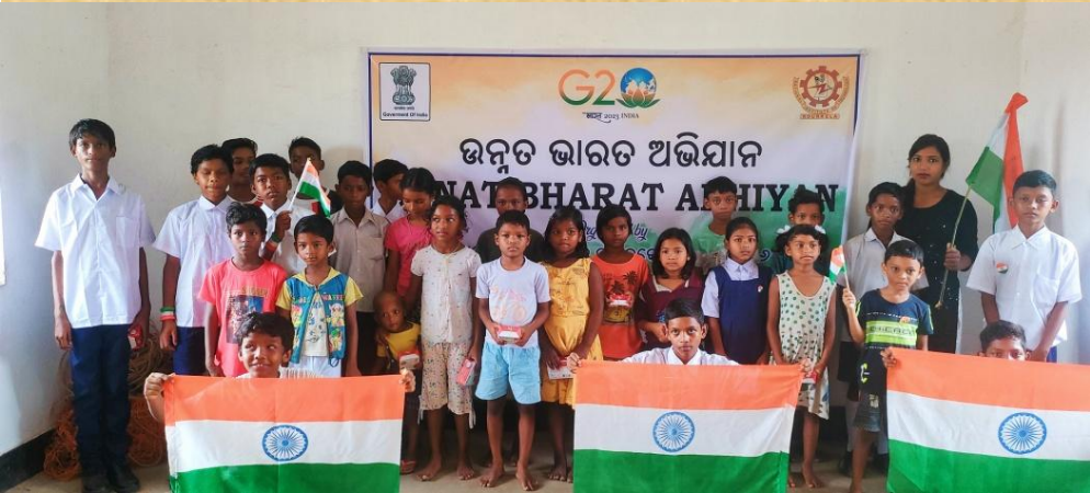
Independence day at Jhirpani village -2023

Small acts when multiplied by millions of people, can transform the world.