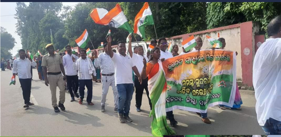
Strike in DRDA square ,Sunderagarh by Sarpanch maha sangha,Sundergarh