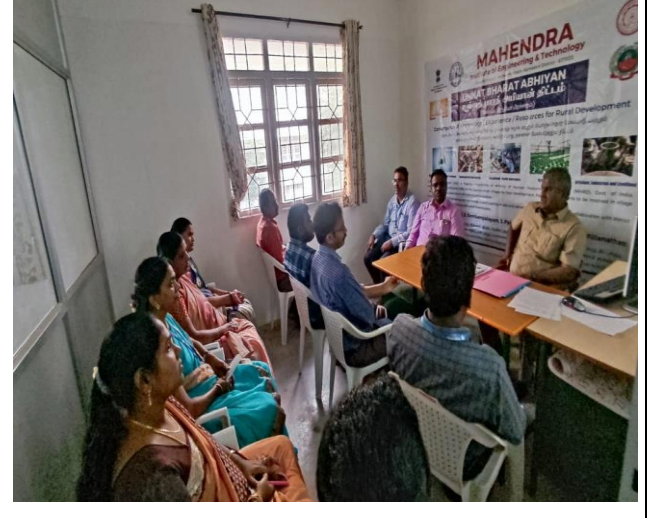
UBA Cell Executive Committee Meeting