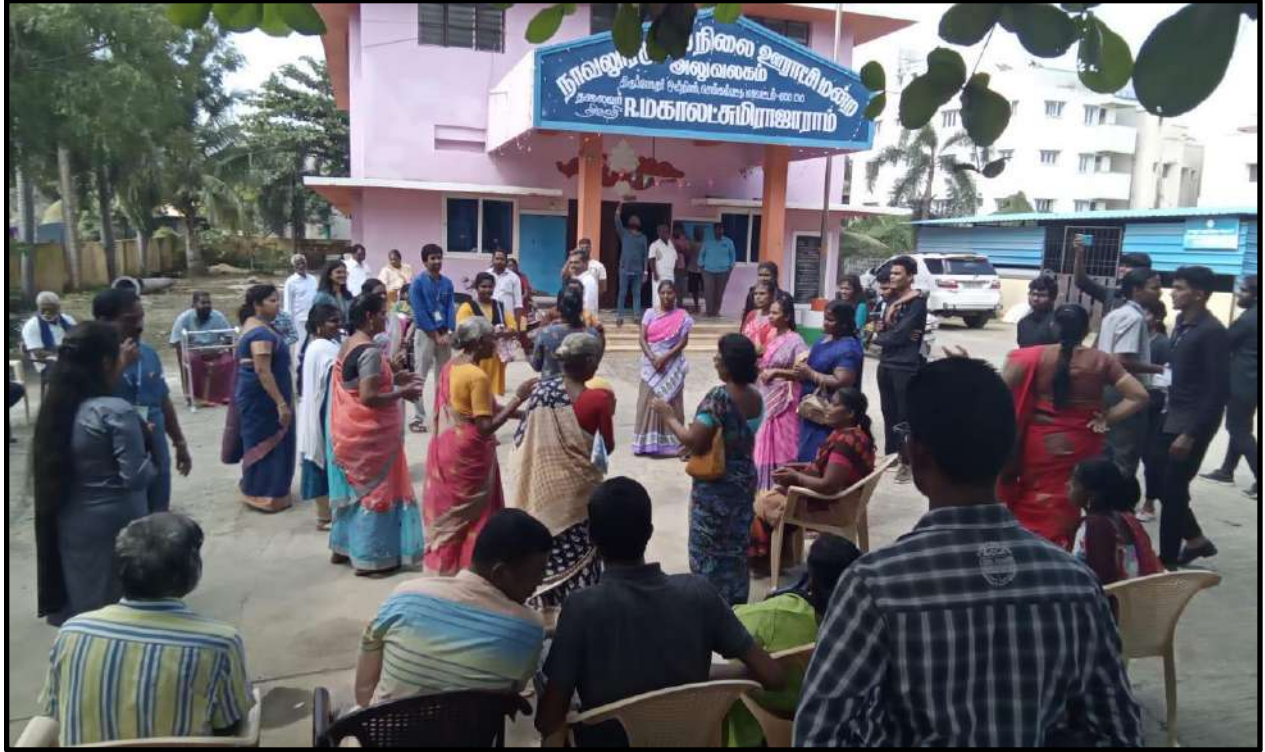
Focused Group Discussion

Name of the Programme: Grama Sabha Meeting & Republic Day Celebration & Activity: Awareness Programme on Girl Child Birth ratio and Social Status on account of National Girl Child Day