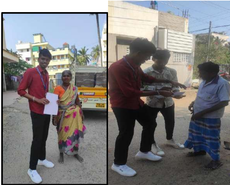
Teaching the people to put their sign