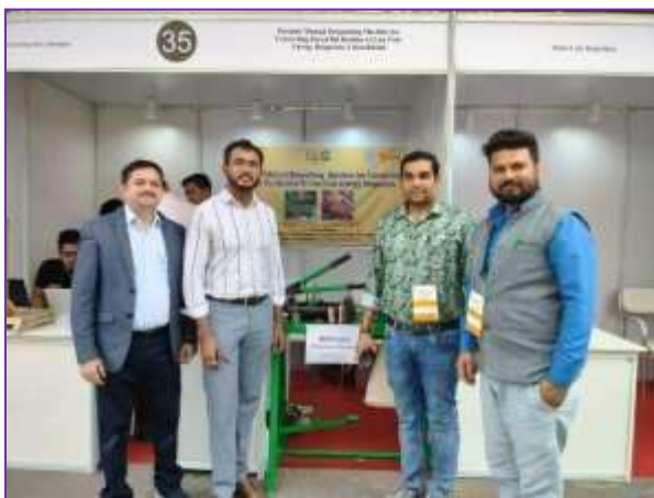
Team UBA IIT Roorkee and other participants