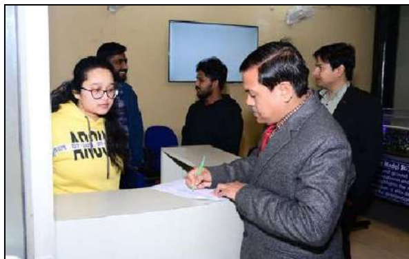
Registration of the Participants for the event