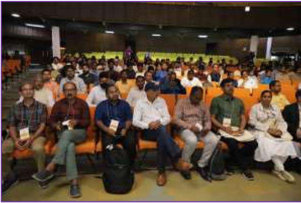
Participants during Inaugural session