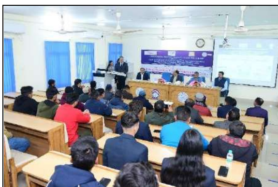
The participants attending the technical session