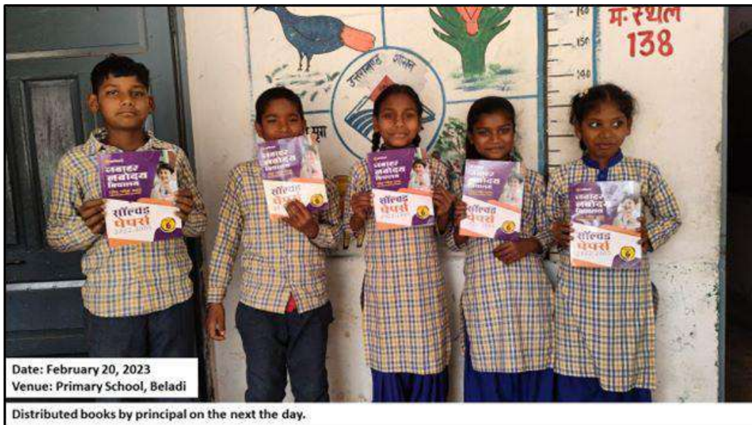
Date: February 20, 2023 Venue: Primary School, Beladi

Distributed books by principal on the next the day.