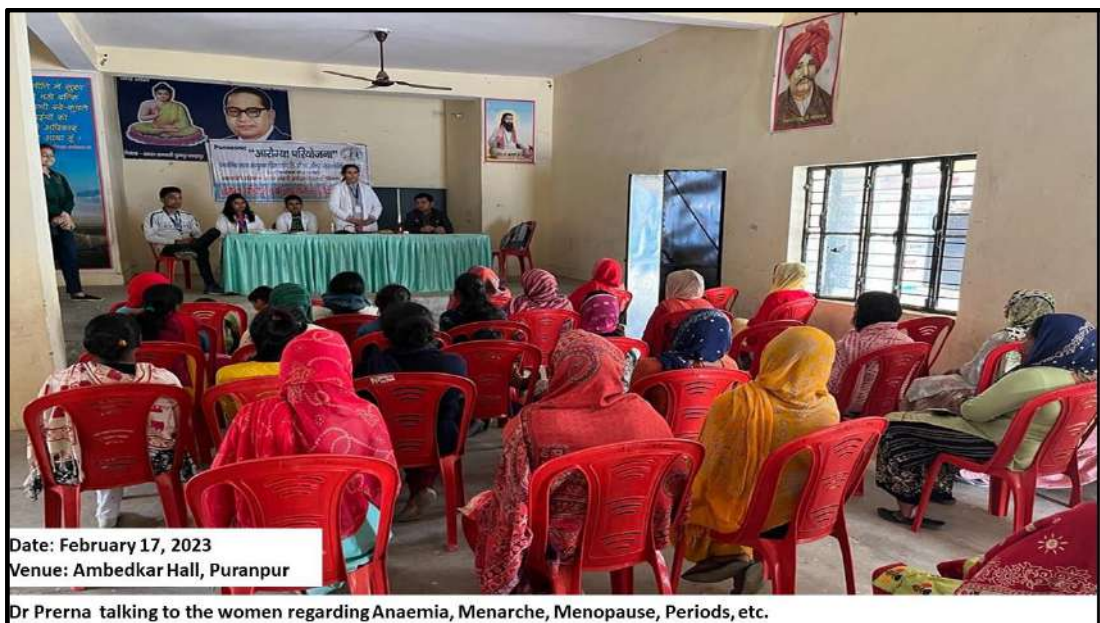
Date: February 17, 2023 Venue: Ambedkar Hall, Puranpur

Description: The poor health of Indian women is a concern on both national and individual levels. It affects the children who will be India's next generation of citizens and workers. It reduces productivity at the household level and in the informal and formal economic sectors. Improving women's health is integral to social and economic development. Most rural areas suffer in terms of health due to a lack of proper medical facilities, awareness, and experienced doctors. Unnat Bharat Abhiyan, IIT Roorkee, took the initiative to improve the health condition of villagers in Puranpur by conducting a free female health camp for girls and women.