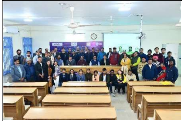
Group photograph of the dignitaries & participants