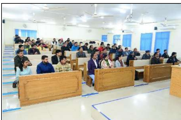
The participants attending the technical session