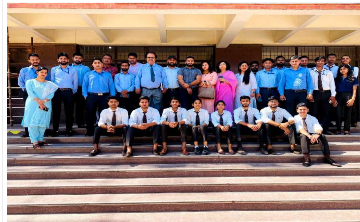
Image: Village Sanitation Programme Participants (School of Agricultural Sciences)

Press Release if any: https://youtu.be/GEQon7iUs4I