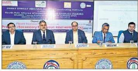
रुड़की आईआईटी में शनिवार को उन्नत भारत अभियान के तहत आयोजित प्रशिक्षण कार्यक्रम में मंचासीन अतिथि।