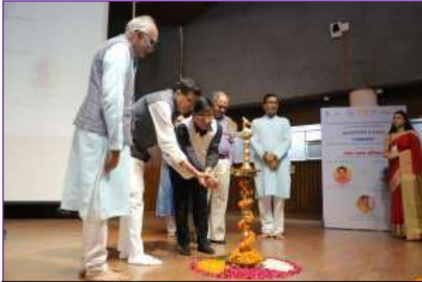
Lamp Lighting by the Chief guests in the inaugural function