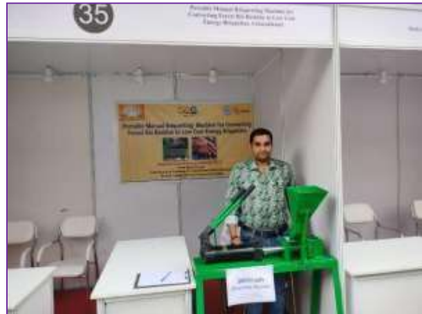
Demonstration of Machine in Stall