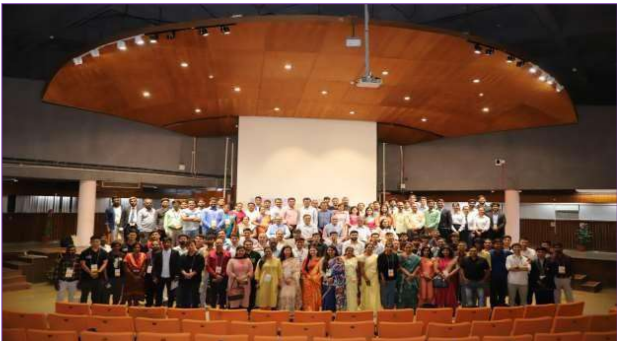
Group photo of all the participants and guests