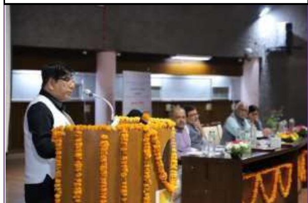
Dr. Subhas Sarkar, Hon'ble Minister of State MoE, addressing the participants