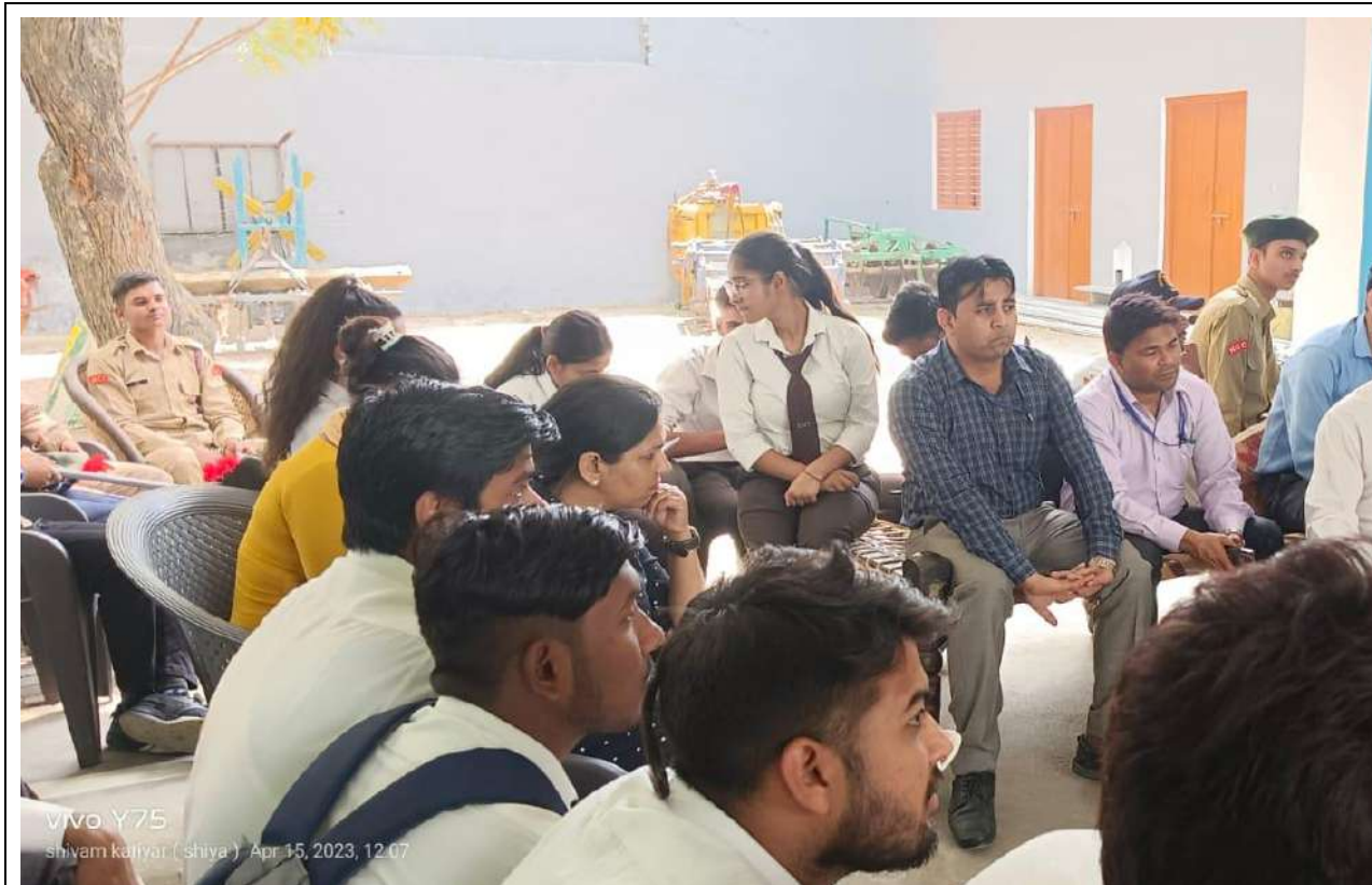
Image: In-situ Workshop at Andavali village on “Role of Oraganic Farming in Agriculture”.