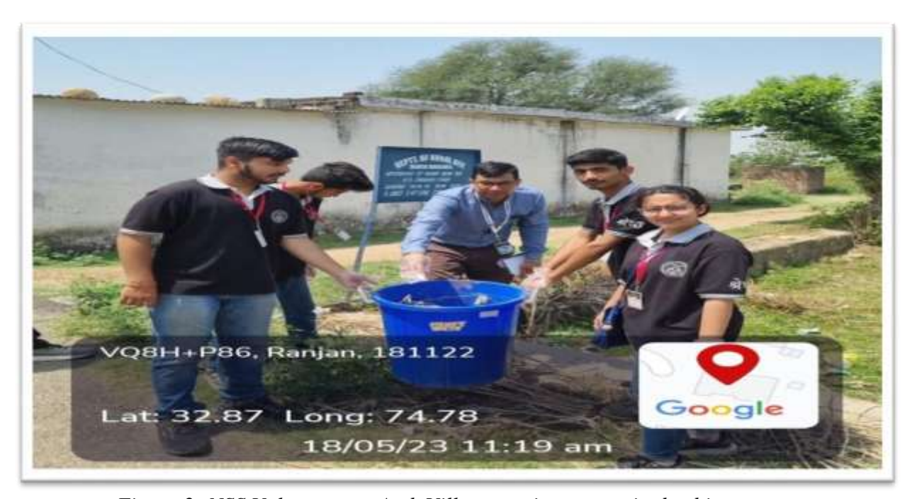
Figure 2: NSS Volunteers at Amb Village putting wastes in dustbin