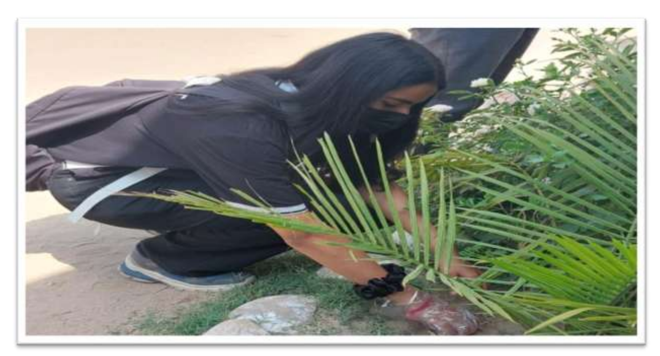
Figure 3: NSS Volunteer from B.COM (H) department cleaning the locality