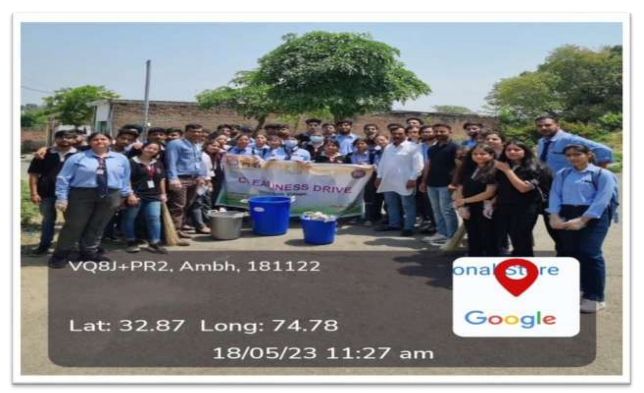
Figure 1: NSS Volunteers reaching at Amb Village for the cleanliness drive