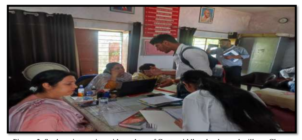
Picture 2: Students interacting with teachers of Govt. middle school at amb village, Gharota