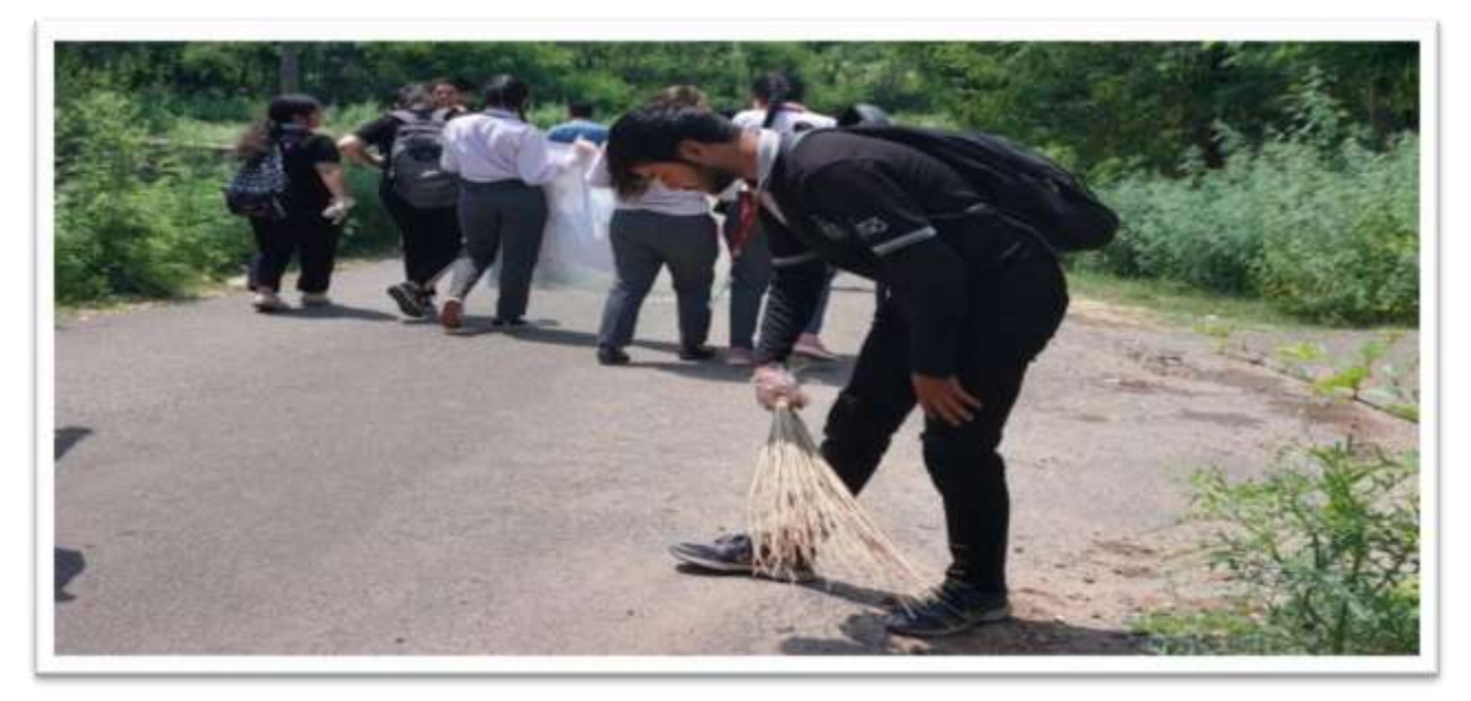
Figure 4: NSS Volunteers removing wastes from roadside