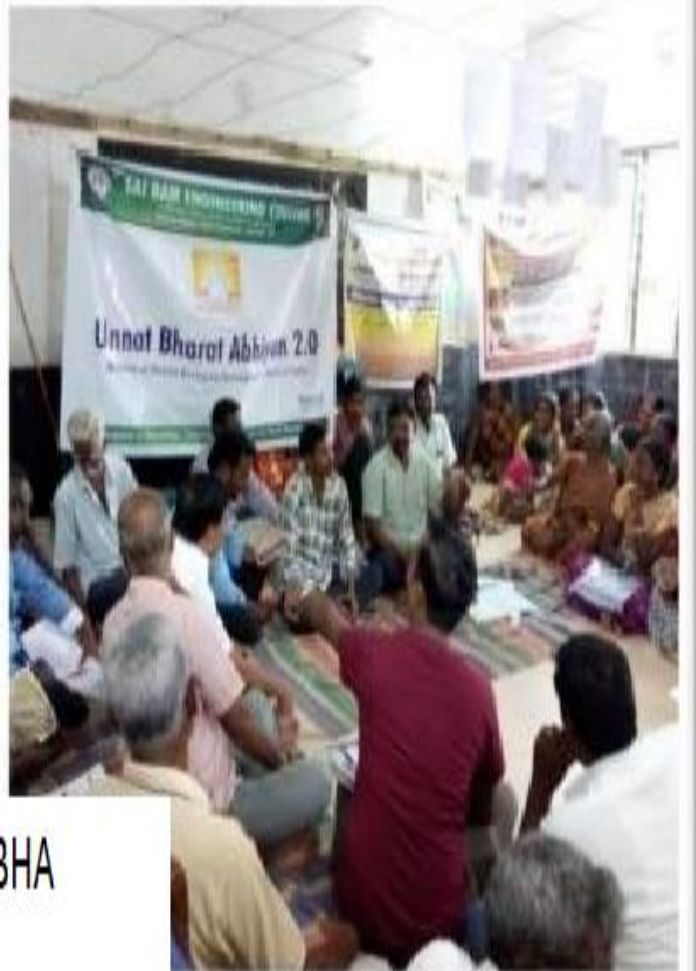
GRAMA SABHA MEETING