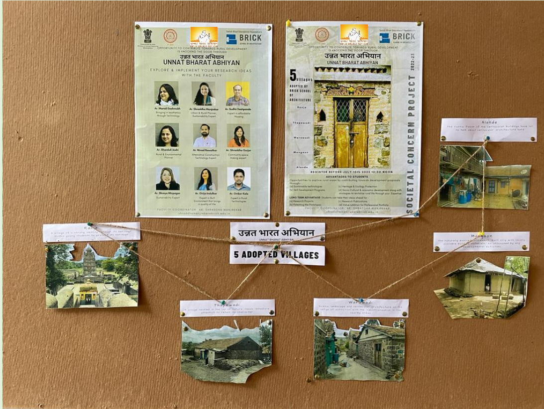
Photographs of the notice board