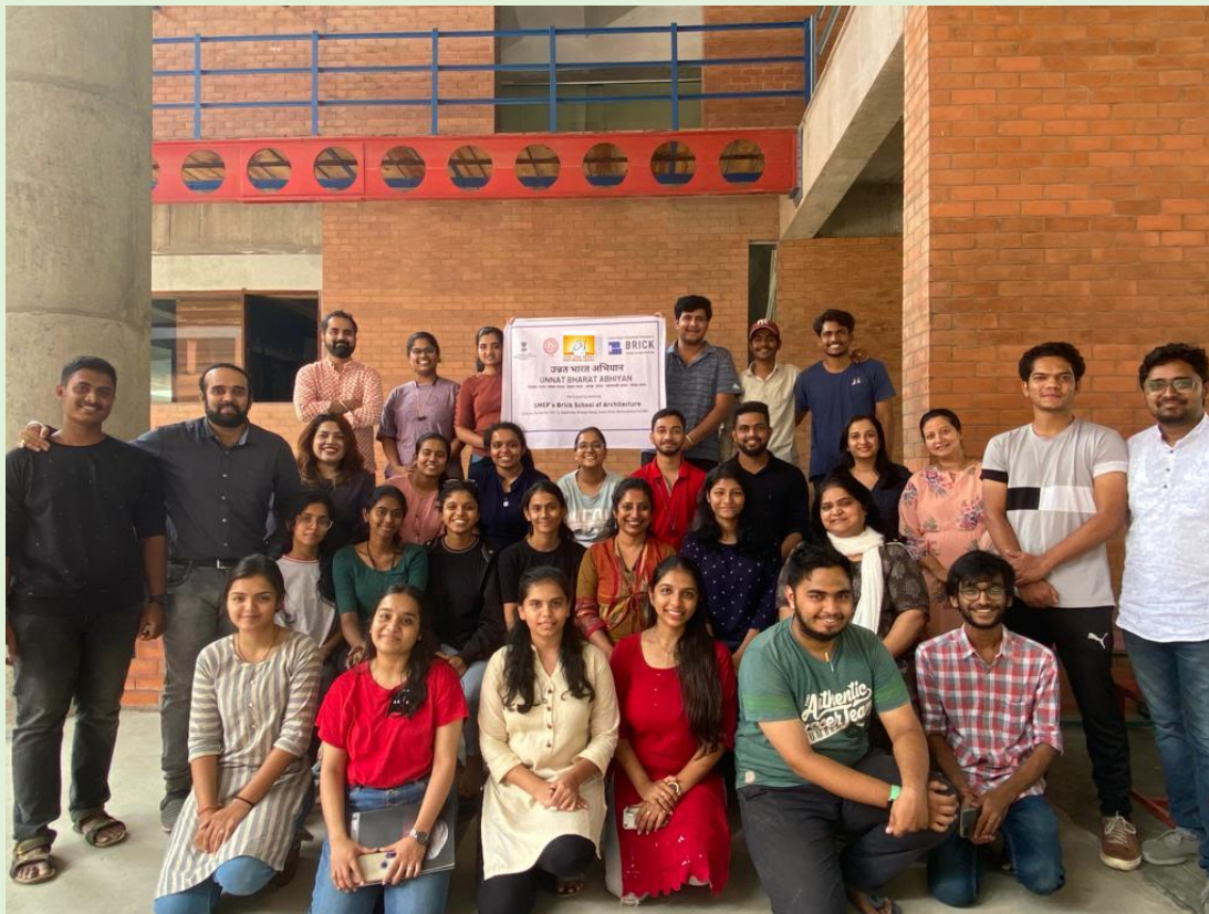
Group of students and faculty who joined Unnat Bharat Abhiyan