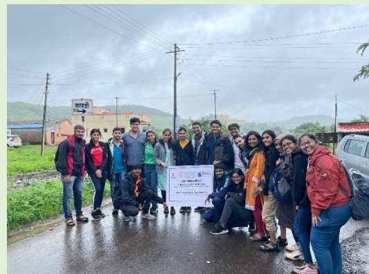
Students working on various sites