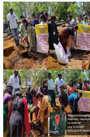
THE UBA, NSS AND ORGANIC FARMING TEAM WITH PRINCIPAL AND MKSP MEMBERS AFTER PLANTING THE SAPLINGS.