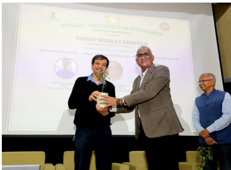
Photo2: Inauguration of workshop