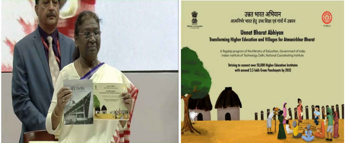
Photo 3: Droupadi Murmu, the Hon'ble Education Minister, Shri Dharmendra Pradhan released a book of Unnat Bharat Abhiyan on the occasion of IIT Delhi

Addressing the PM, he described the message on the completion of eight years of Unnat Bharat Abhiyan as a memorable occasion. Referring to the Prime Minister's letter, he said that India can become a developed country in the next 25 years on the basis of education and rural development; these tools can play a major role. He suggested how the education system is linked to the grass root level people and provides moral contribution to the rural community and also increases employment generation. He talked about the National Education Policy (NEP) to reform the higher education system by providing flexibility to the student.