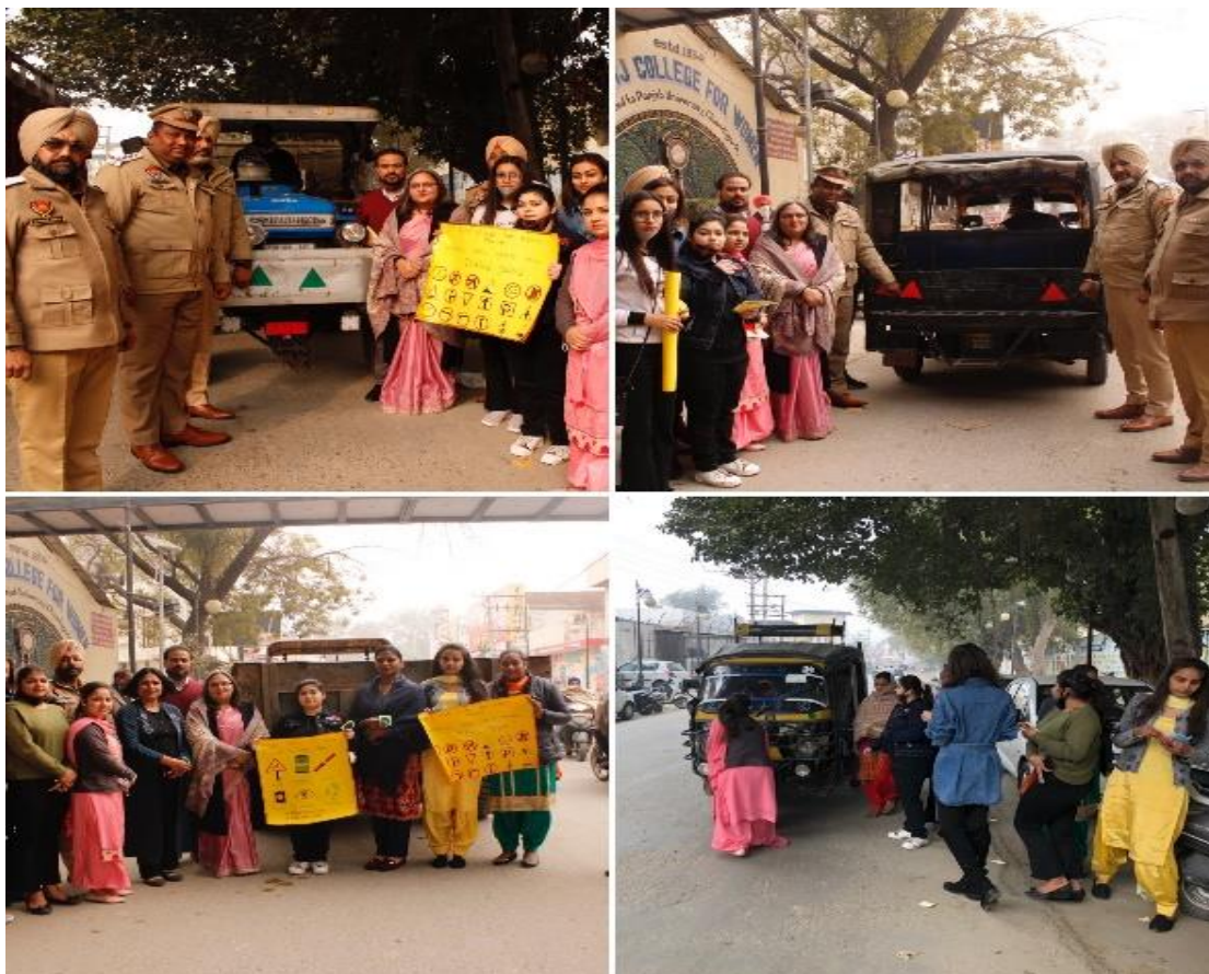
“Various pictures taken during the event”