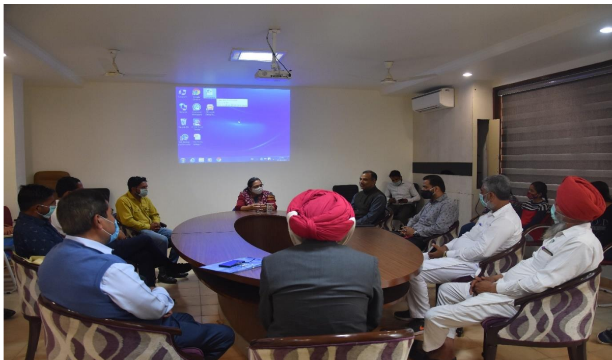
A glimpse of the Seminar