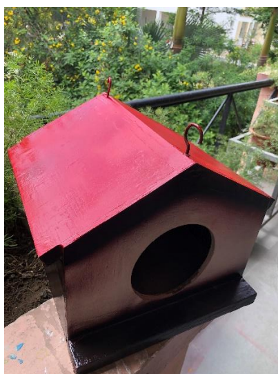
A bird house built by the students