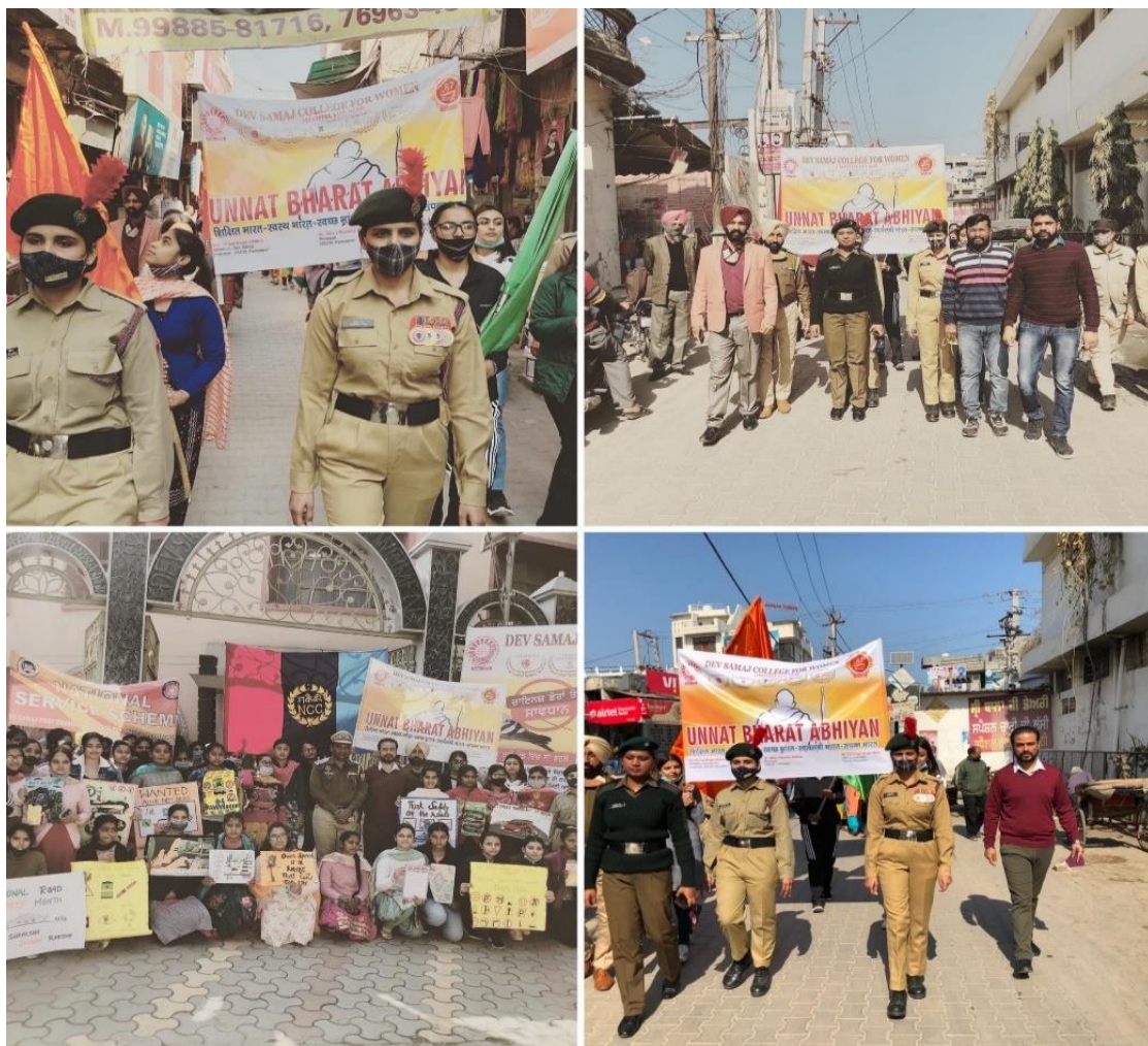
Road Rally for traffic rules awareness