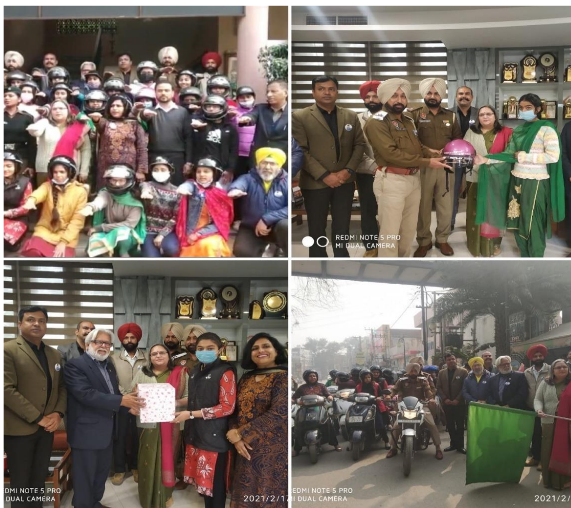
Various Moments during the road rally event