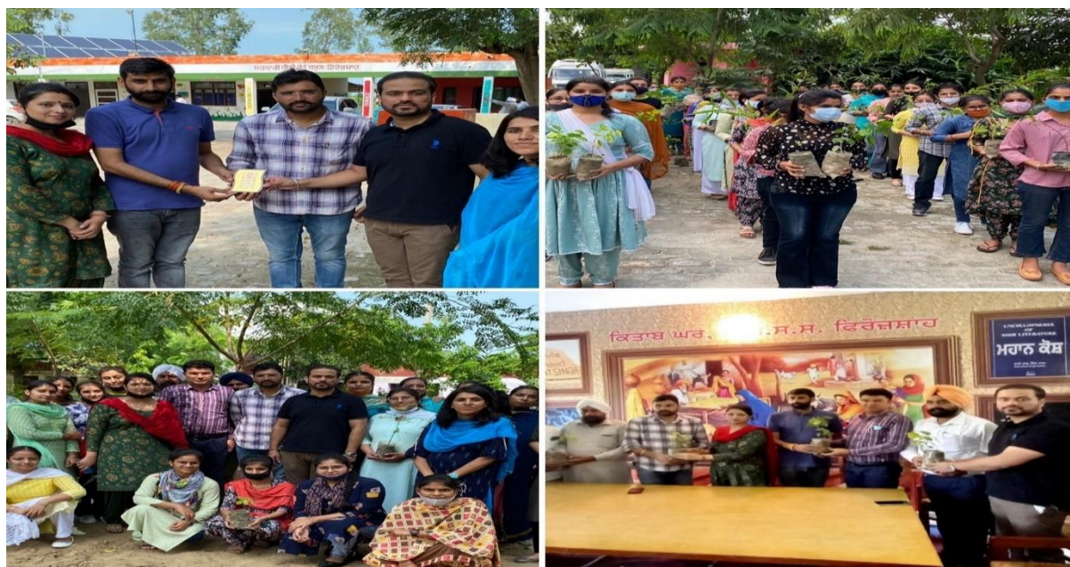
Glimpses from the event