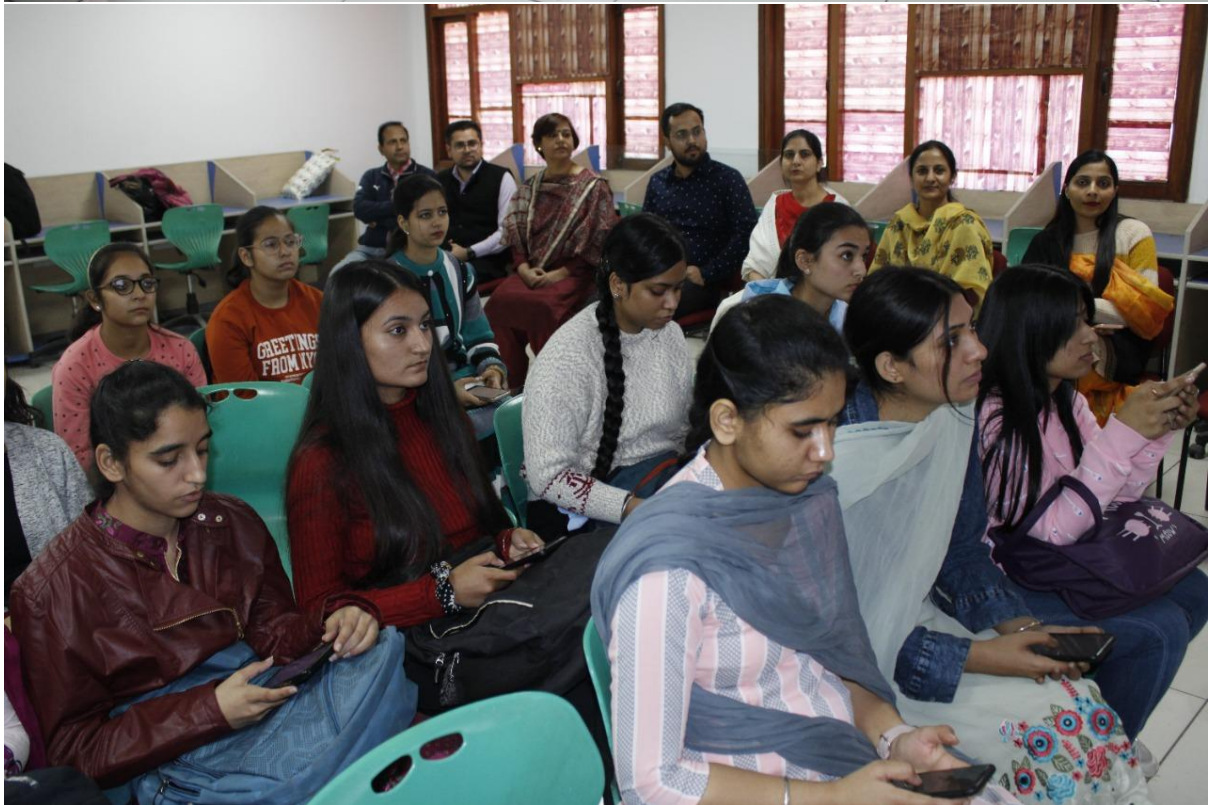
Students participating in Online Quiz competition