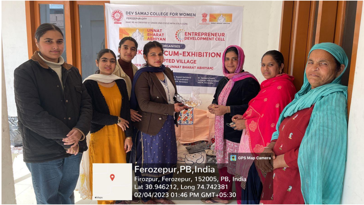
Demonstrating cookies made by Department of Nutrition and Dietetics different handwork items made by Department of Textile and Fashion Designing