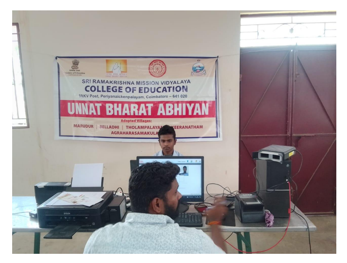
Aadhaar Camp at Marudur Village